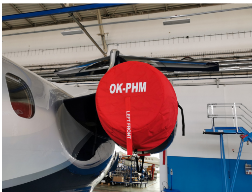
Embraer Phenom 300 ENGINE INLET COVERS & EXHAUST PLUGS (includes lower nacelle plug) (set of 6)

The Embraer Phenom 300 (EMB-505) Intake/Exhaust Plugs are custom fit for the intake and exhaust openings, made with heavy-duty vinyl material, and stuffed with a single block of sculpted urethane foam. Each plug has a zipper that allows the foam to be removed and dried if necessary. Engine plugs have 'remove before flight' streamers sewn onto the face of the plugs. Most plugs are imprinted with the aircraft registration number in black. Engine plugs may be inserted after flight when the engine is still warm. Engine Inlet Plugs are commonly referred to as Cowl Plugs, Intake Plugs, Cowl Blocks, Engine Blocks, and Engine Bungs.