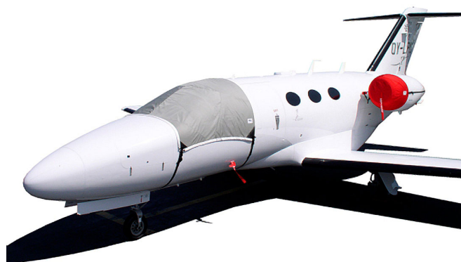
Citation Mustang Cockpit/Door/Nose Cover, Engine Inlet Cover