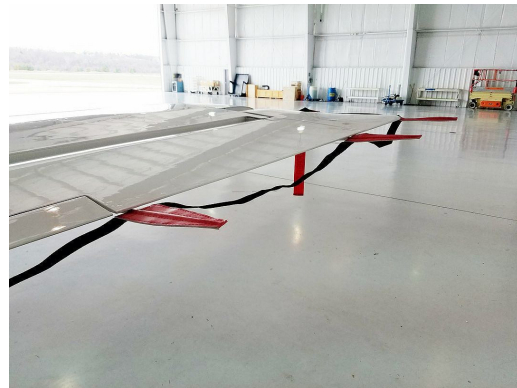
Hawker Beechcraft 800, 800XP, 850XP Static Wick Protectors