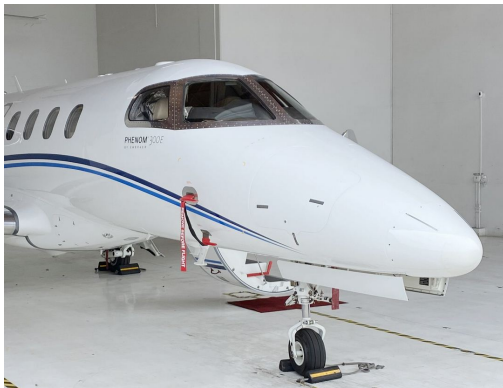
Embraer EMB-505 Pitot Cover Set

The Engine Inlet Plugs are custom fit for your Embraer Phenom 300 (EMB-505) intakes, made with heavy-duty vinyl material, and stuffed with a single block of sculpted urethane foam. Each plug has a zipper that allows the foam to be removed and dried if necessary. Engine plugs have 'remove before flight' streamers sewn onto the face of the plugs. Most plugs are imprinted with the aircraft registration number in black for an extra charge. Storage bag NOT included. Engine plugs may be inserted after flight when the engine is still warm. Engine Inlet Plugs are commonly referred to as Cowl Plugs, Intake Plugs, Cowl Blocks, Engine Blocks, and Engine Bungs.