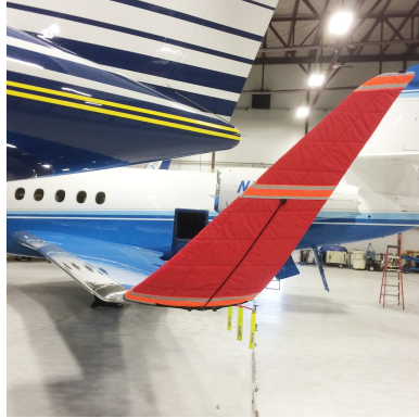
Falcon 2000 Winglet Pad