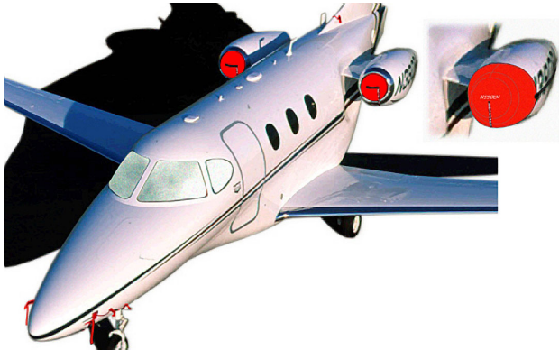
Premier Intake Plugs, Intake Covers, Pitot Covers & Cockpit HeatShields