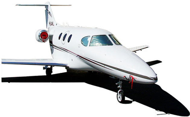
Raytheon Premier Intake Plugs, Pitot Covers & Cockpit HeatShields