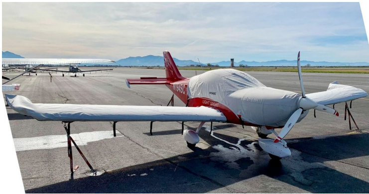
Czech Sport Canopy/Engine & Wing Covers

This cover type is made from Silver Acrylic Sunbrella canvas and is 100% lined with a soft and smooth microfiber. Bruce's Custom Covers developed this material combination especially for aircraft protection. The outer material is medium weight and treated for water resistance, UV resistance and anti-static buildup. The inner lining is a very soft and smooth microfiber to prevent scratching. The material is very reflective, and tests show that the cabin interior temperature can be reduced to near-ambient temperature on the hottest of days. It is water, ice and snow repellent, yet breathable to allow moisture to escape from between the cover and the aircraft surface.