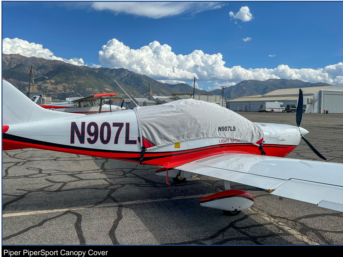
Piper PiperSport Canopy Cover