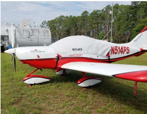
PiperSport Canopy Cover

This cover type is made from Silver Acrylic Sunbrella canvas and is 100% lined with a soft and smooth microfiber. Bruce's Custom Covers developed this material combination especially for aircraft protection. The outer material is medium weight and treated for water resistance, UV resistance and anti-static buildup. The inner lining is a very soft and smooth microfiber to prevent scratching. The material is very reflective, and tests show that the cabin interior temperature can be reduced to near-ambient temperature on the hottest of days. It is water, ice and snow repellent, yet breathable to allow moisture to escape from between the cover and the aircraft surface.