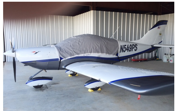
PiperSport Light Weight Travel Cover