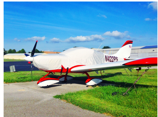
SportCruiser Canopy/Engine Cover