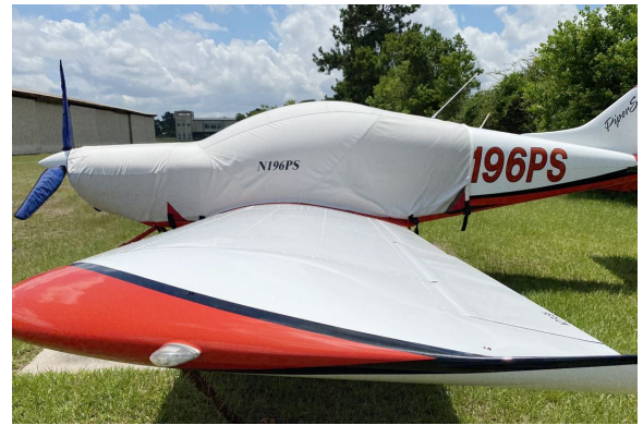
PiperSport Extended Canopy/Engine Cover