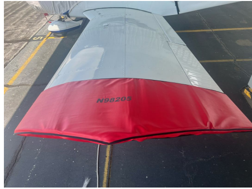
Piper PA-28-140 Wingtip Pads