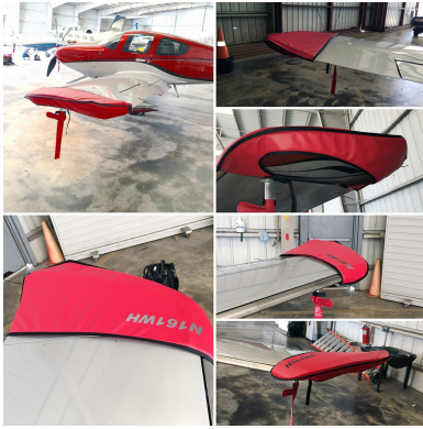
Cirrus SR22 Wingtip Pads, G5 Models

Designed to prevent damage to the aircraft extremities in crowded hangars, these products are made of bright red Naugahyde and thickly padded with a sandwich of closed cell foam.