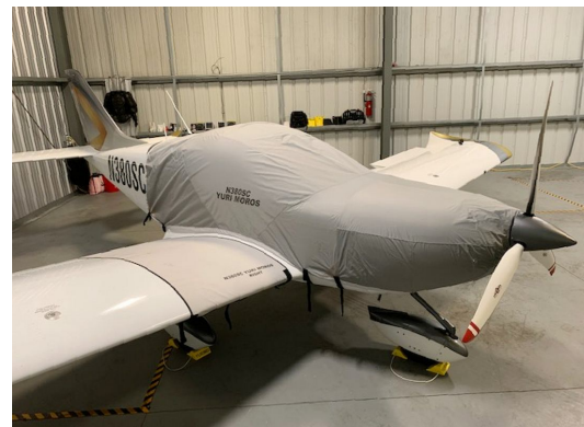
Czech Sport Travel Light Weight Canopy/Engine Cover, Wing Locker Covers