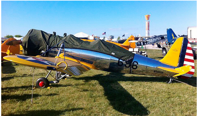
Ryan PT-22 ST3KR Canopy Cover and Engine Cover