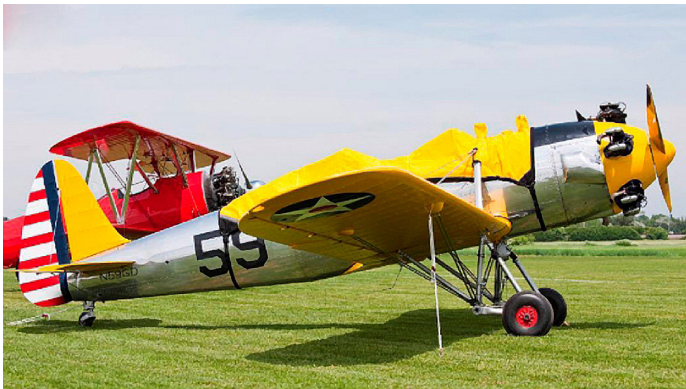
The Ryan PT-22 Canopy Cover

This cover type is made from Silver Acrylic Sunbrella canvas and is 100% lined with a soft and smooth microfiber. Bruce's Custom Covers developed this material combination especially for aircraft protection. The outer material is medium weight and treated for water resistance, UV resistance and anti-static buildup. The inner lining is a very soft and smooth microfiber to prevent scratching. The material is very reflective, and tests show that the cabin interior temperature can be reduced to near-ambient temperature on the hottest of days. It is water, ice and snow repellent, yet breathable to allow moisture to escape from between the cover and the aircraft surface.