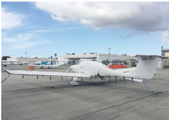
Diamond DA-40 Full Cover Set

This cover type is made from Silver Acrylic Sunbrella canvas and is 100% lined with a soft and smooth microfiber. Bruce's Custom Covers developed this material combination especially for aircraft protection. The outer material is medium weight and treated for water resistance, UV resistance and anti-static buildup. The inner lining is a very soft and smooth microfiber to prevent scratching. The material is very reflective, and tests show that the cabin interior temperature can be reduced to near-ambient temperature on the hottest of days. It is water, ice and snow repellent, yet breathable to allow moisture to escape from between the cover and the aircraft surface.