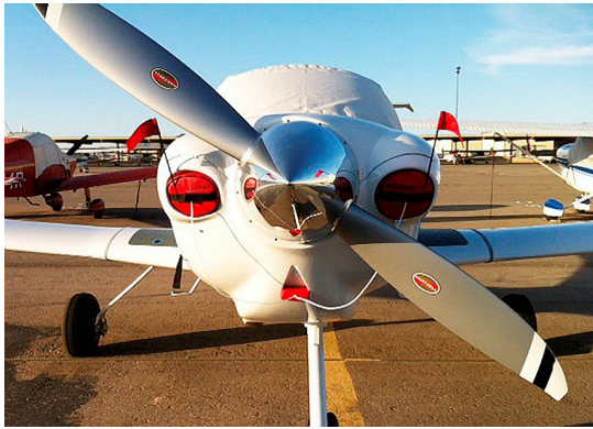
Diamond DA-40 Engine Inlet Plugs (set of 3)

Engine Inlet Plugs are custom fit for your Pipistrel Panthera intakes, made with heavy-duty vinyl material, and stuffed with a single block of sculpted urethane foam. Each plug has a zipper that allows the foam to be removed and dried if necessary. Engine plugs have warning flags that are visible from the cockpit or 'remove before flight' streamers sewn onto the face of the plugs. Most plugs are imprinted with the aircraft registration number in black for an extra charge. Storage bag NOT included. Engine plugs may be inserted after flight when the engine is still warm. Engine Inlet Plugs are commonly referred to as Cowl Plugs, Intake Plugs, Cowl Blocks, Engine Blocks, and Engine Bungs.