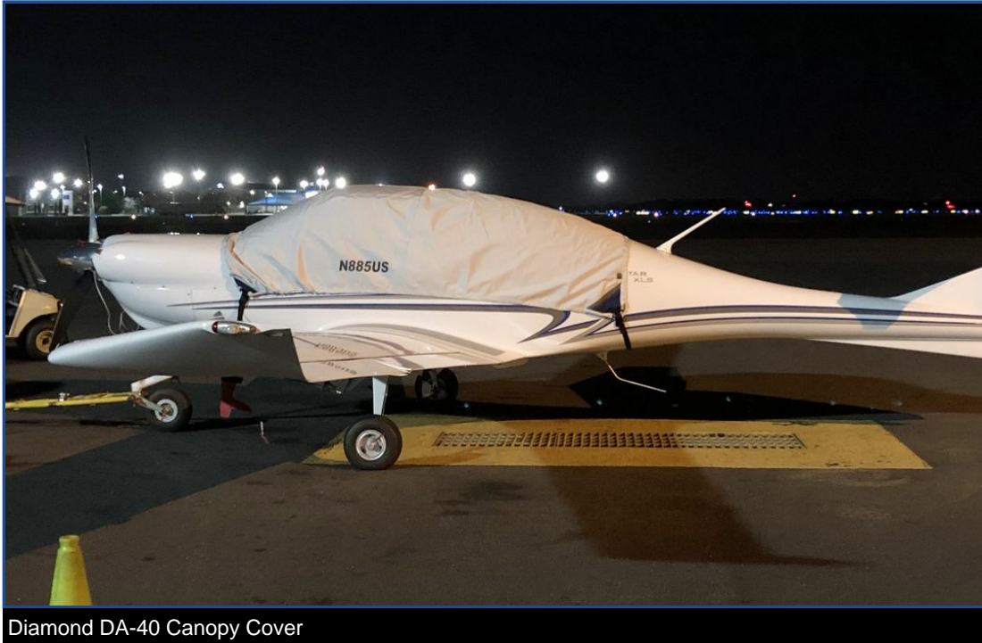
Diamond DA-40 Canopy Cover