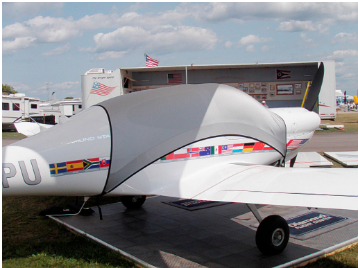
Diamond DA-40 Light Weight Travel Cover (Spandex Flyaway Type)

Travel Covers are made with Silver Solution-Dyed Polyester fabric and only lined over the windshield to save weight. The material is lightweight and more compact for easy stowage in the aircraft. The polyester material is water resistant, but only intended for occasional use outside. We also have an ultra lightweight material available for fitted hangar dust covers. For daily outdoor use, the non-travel Sunbrella Cover is the best choice.