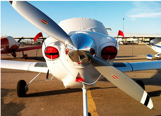
Diamond DA-40 Engine Inlet Plugs (set of 3)

Engine Inlet Plugs are custom fit for your Pipistrel Panthera intakes, made with heavy-duty vinyl material, and stuffed with a single block of sculpted urethane foam. Each plug has a zipper that allows the foam to be removed and dried if necessary. Engine plugs have warning flags that are visible from the cockpit or 'remove before flight' streamers sewn onto the face of the plugs. Most plugs are imprinted with the aircraft registration number in black for an extra charge. Storage bag NOT included. Engine plugs may be inserted after flight when the engine is still warm. Engine Inlet Plugs are commonly referred to as Cowl Plugs, Intake Plugs, Cowl Blocks, Engine Blocks, and Engine Bungs.