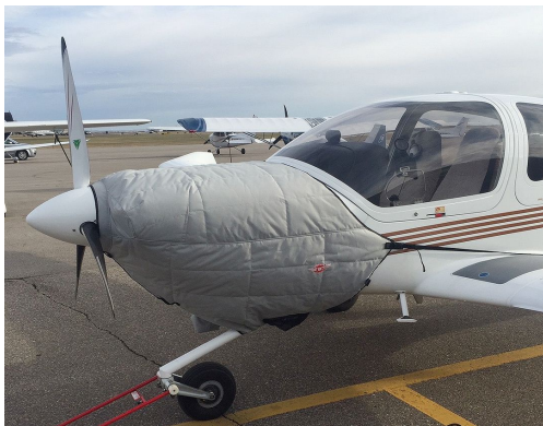
Diamond DA-40 Insulated Engine Cover

This cover type is made from Silver Acrylic Sunbrella canvas and is 100% lined with a soft and smooth microfiber. Bruce's Custom Covers developed this material combination especially for aircraft protection. The outer material is medium weight and treated for water resistance, UV resistance and anti-static buildup. The inner lining is a very soft and smooth microfiber to prevent scratching. The material is very reflective, and tests show that the cabin interior temperature can be reduced to near-ambient temperature on the hottest of days. It is water, ice and snow repellent, yet breathable to allow moisture to escape from between the cover and the aircraft surface.