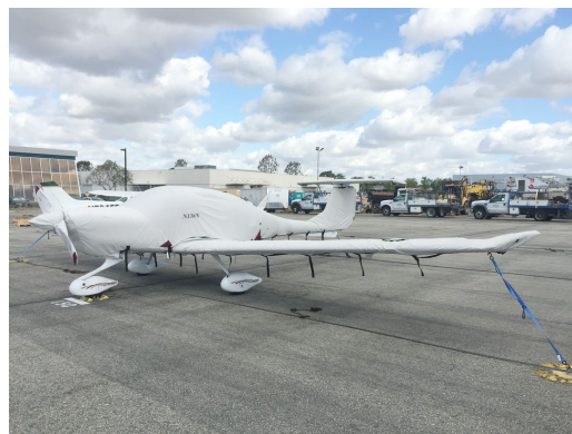
Diamond DA-40 Full Cover Set