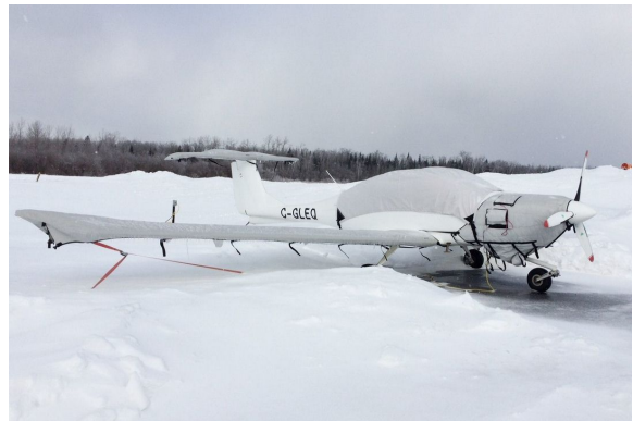
Diamond DA40 Canopy, Insulated Engine, Wing and Stab. Covers