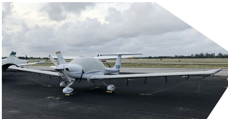
Diamond DA-40 180 Star All Year Use Wing Covers

WINTER USE MATERIAL - Made with Solution-Dyed Polyester fabric, this option is intended for seasonal use to aid in deicing, rain mitigation, or for occasional travel. The material is lighter and more compact, but more susceptible to UV damage and may have a shorter useful life if used continuously outside than the all-year use material.