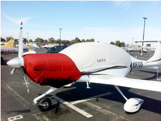
Diamond DA-40 Insulated Engine Cover, Red

This cover type is made from Silver Acrylic Sunbrella canvas and is 100% lined with a soft and smooth microfiber. Bruce's Custom Covers developed this material combination especially for aircraft protection. The outer material is medium weight and treated for water resistance, UV resistance and anti-static buildup. The inner lining is a very soft and smooth microfiber to prevent scratching. The material is very reflective, and tests show that the cabin interior temperature can be reduced to near-ambient temperature on the hottest of days. It is water, ice and snow repellent, yet breathable to allow moisture to escape from between the cover and the aircraft surface.