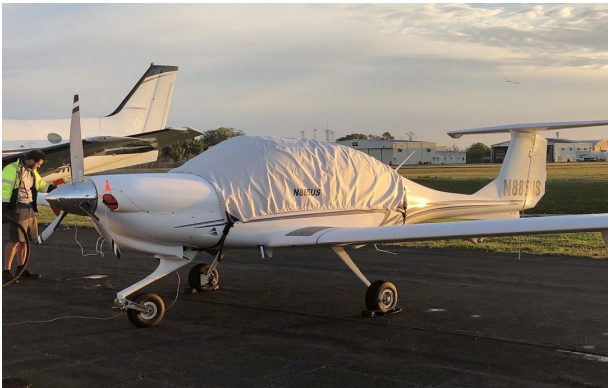
Diamond DA-40 Canopy Cover & Engine Plugs

This cover type is made from Silver Acrylic Sunbrella canvas and is 100% lined with a soft and smooth microfiber. Bruce's Custom Covers developed this material combination especially for aircraft protection. The outer material is medium weight and treated for water resistance, UV resistance and anti-static buildup. The inner lining is a very soft and smooth microfiber to prevent scratching. The material is very reflective, and tests show that the cabin interior temperature can be reduced to near-ambient temperature on the hottest of days. It is water, ice and snow repellent, yet breathable to allow moisture to escape from between the cover and the aircraft surface.