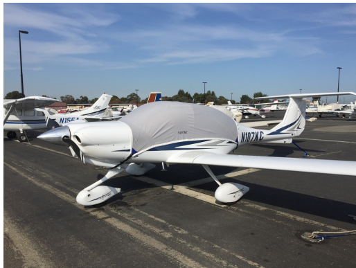
Diamond DA-40 Travel Cover, Light Weight Travel Canopy Cover

Travel Covers are made with Silver Solution-Dyed Polyester fabric and only lined over the windshield to save weight. The material is lightweight and more compact for easy stowage in the aircraft. The polyester material is water resistant, but only intended for occasional use outside. We also have an ultra lightweight material available for fitted hangar dust covers. For daily outdoor use, the non-travel Sunbrella Cover is the best choice.