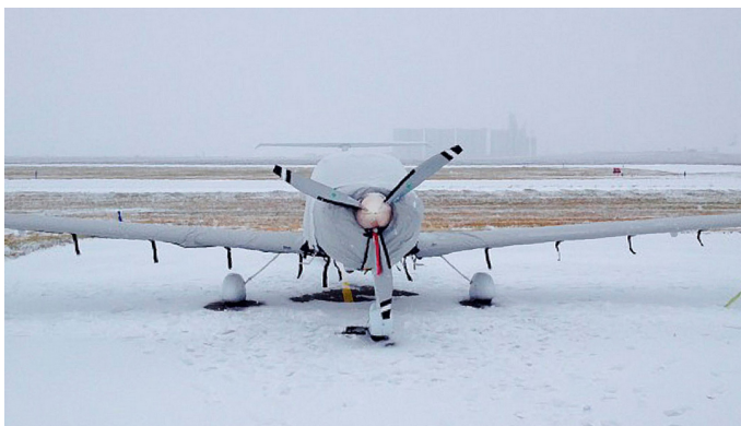
Diamond DA-40 Extended Canopy Cover, Wing Covers & Insulated Engine Cover

WINTER USE MATERIAL - Made with Solution-Dyed Polyester fabric, this option is intended for seasonal use to aid in deicing, rain mitigation, or for occasional travel. The material is lighter and more compact, but more susceptible to UV damage and may have a shorter useful life if used continuously outside than the all-year use material.