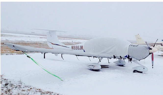
Diamond DA-40 Extended Canopy Cover, Wing Covers & Insulated Engine Cover