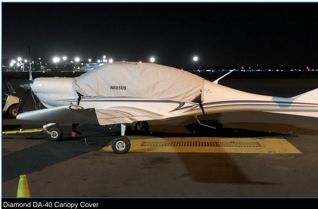
Diamond DA-40 Canopy Cover