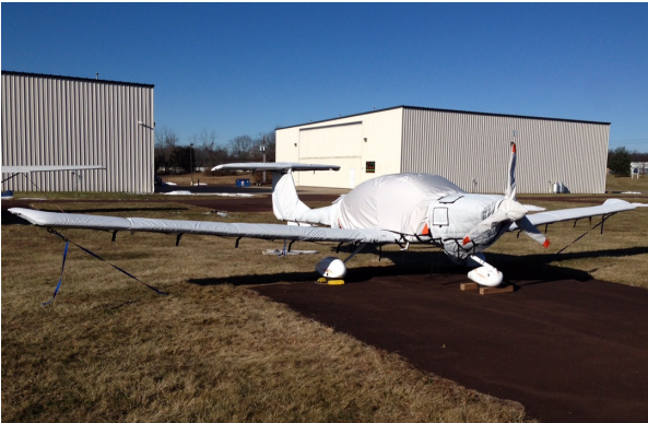
Diamond DA-40 Full Cover Set, with Insulated Engine Cover