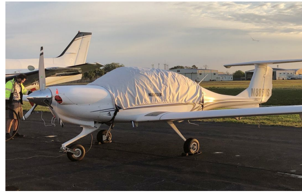
Diamond DA-40 Canopy Cover & Engine Plugs