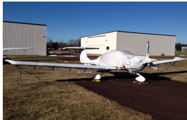
Diamond DA-40 Full Cover Set, with Insulated Engine Cover