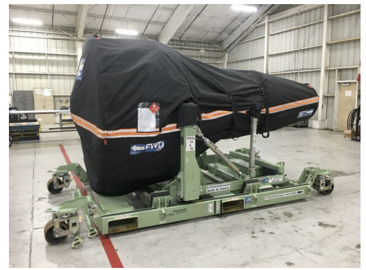
PW JT8D Off-Link Engine Transport Cover (no nose cone, no TR's), fully enclosed