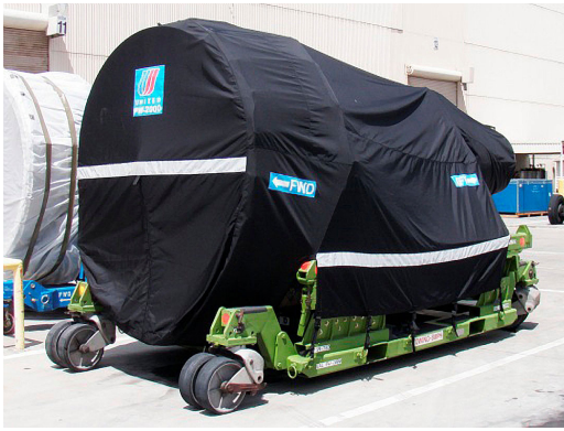
PW 2000 SERIES OFF-LINK ENGINE COVER, "rain cap" style PW JT9D Series Off-Link Engine Transport Cover, Fully Enclosed, P/N: PW-120