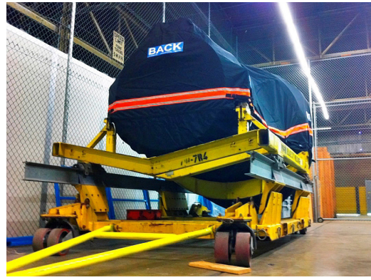
PW JT9D Series Off-Link Engine Transport Cover, Fully Enclosed, P/N: PW-120