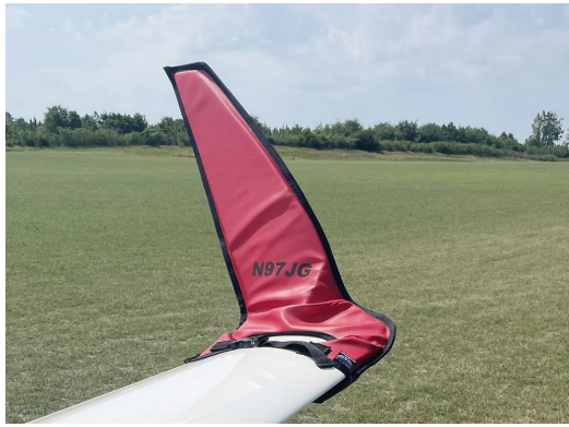
Schempp-Hirth Ventus-2B winglet/wingtip pads