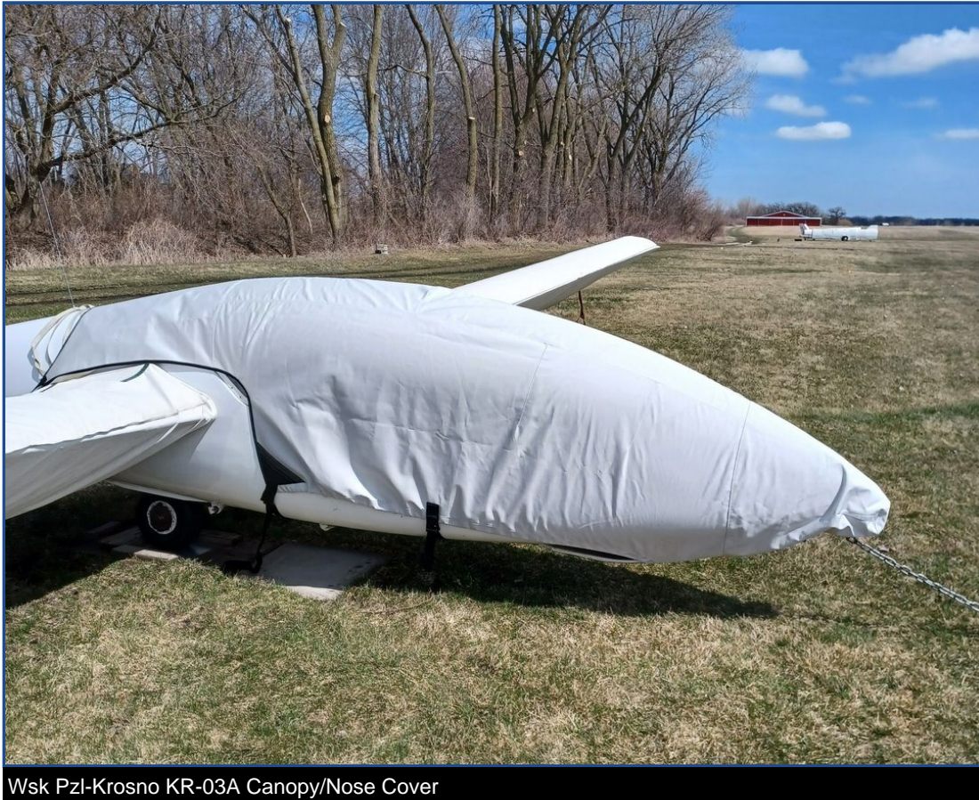
Wsk Pzl-Krosno KR-03A Canopy/Nose Cover