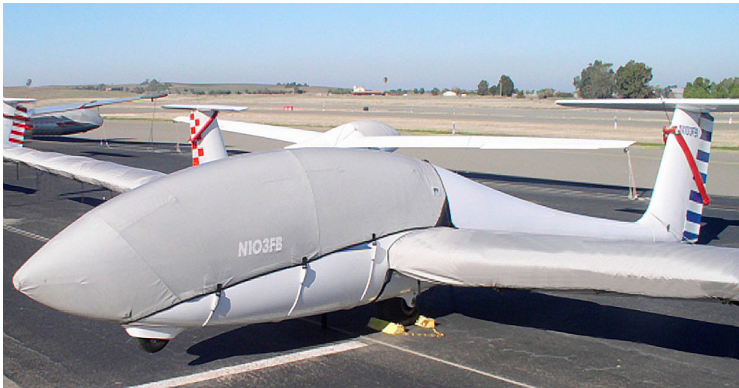
Grob 103 Canopy/Nose Cover and Wing Covers

Covers developed this material combination especially for aircraft protection. The outer material is medium weight and treated for water resistance, UV resistance and anti-static buildup. The inner lining is a very soft and smooth microfiber to prevent scratching. The material is very reflective, and tests show that the cabin interior temperature can be reduced to near-ambient temperature on the hottest of days. It is water, ice and snow repellent, yet breathable to allow moisture to escape from between the cover and the aircraft surface.