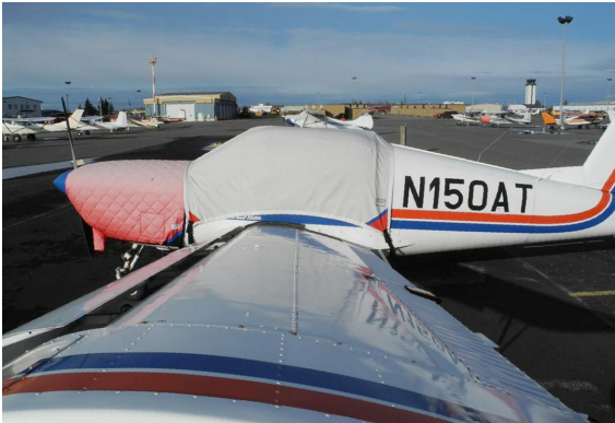
Koliber 150A Canopy Cover, Insulated Engine Cover