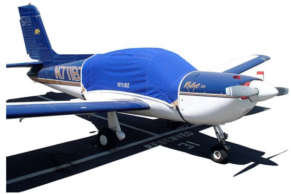
Rallye Canopy Cover