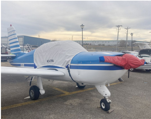
SOCATA Rallye 150 Canopy Cover, Prop Cover

This cover type is made from Silver Acrylic Sunbrella canvas and is 100% lined with a soft and smooth microfiber. Bruce's Custom Covers developed this material combination especially for aircraft protection. The outer material is medium weight and treated for water resistance, UV resistance and anti-static buildup. The inner lining is a very soft and smooth microfiber to prevent scratching. The material is very reflective, and tests show that the cabin interior temperature can be reduced to near-ambient temperature on the hottest of days. It is water, ice and snow repellent, yet breathable to allow moisture to escape from between the cover and the aircraft surface.