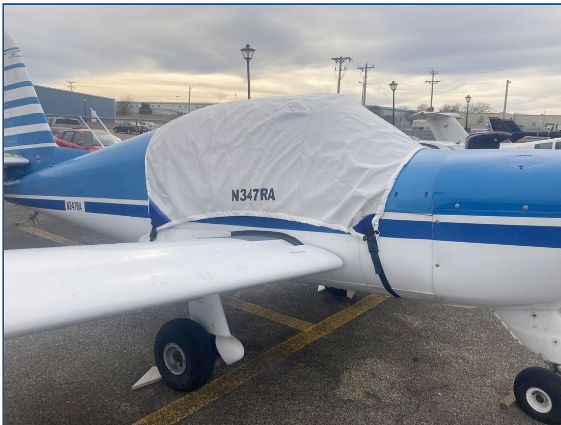
SOCATA Rallye 150 Canopy Cover