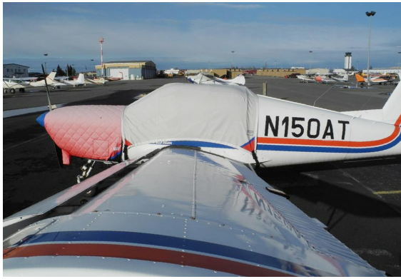
Koliber 150A Canopy Cover, Insulated Engine Cover