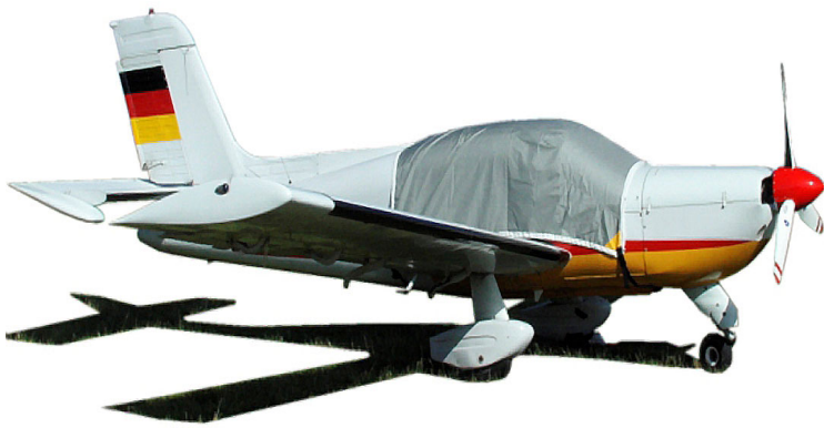
Rallye 150 Canopy Cover

The Aerospatiale (Socata) Rallye 150 Canopy/Engine Cover is a one-piece cover (100% lined with microfiber) that is a combination of the Canopy Cover and Engine Cover. This cover will enclose the engine cowl and will extend aft to cover all of the windows. This cover type is made from Silver Acrylic Sunbrella canvas and is 100% lined with a soft and smooth microfiber. Bruce's Custom Covers developed this material combination especially for aircraft protection. The outer material is medium weight and treated for water resistance, UV resistance and anti-static buildup. The inner lining is a very soft and smooth microfiber to prevent scratching. The material is very reflective, and tests show that the cabin interior temperature can be reduced to near-ambient temperature on the hottest of days. It is water, ice and snow repellent, yet breathable to allow moisture to escape from between the cover and the aircraft surface.