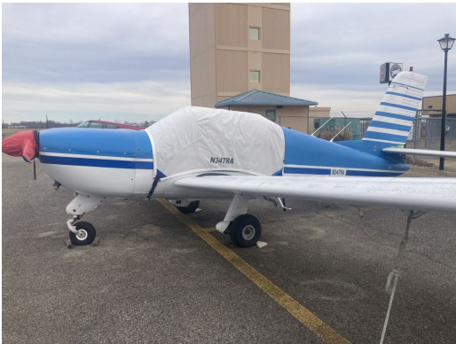
SOCATA Rallye 150 Canopy Cover, Prop Cover