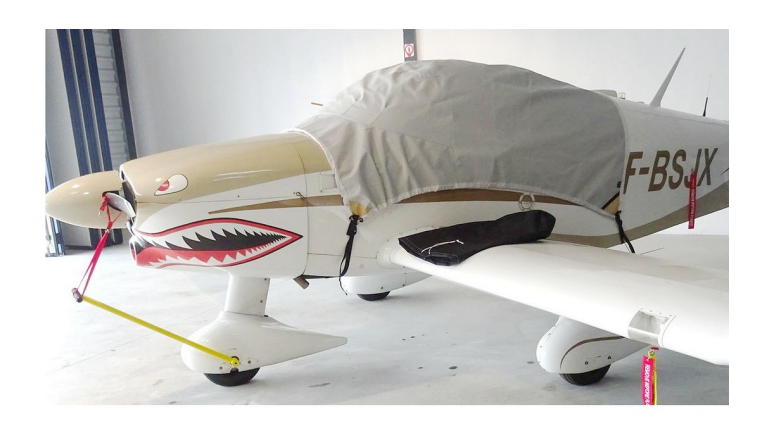
Robin DR300 Travel Cover