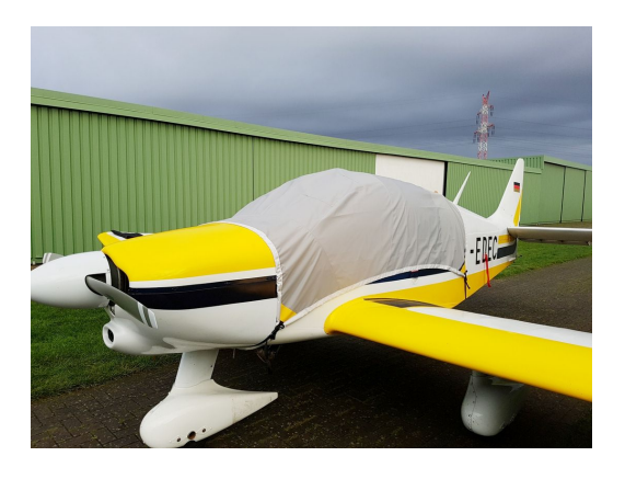
Robin DR400/R Travel Cover, Light Weight Travel Canopy Cover