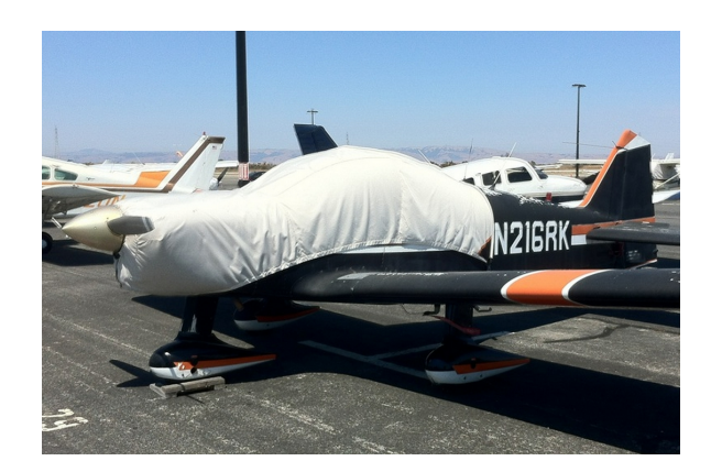
Robin Canopy/Engine Cover

This cover type is made from Silver Acrylic Sunbrella canvas and is 100% lined with a soft and smooth microfiber. Bruce's Custom Covers developed this material combination especially for aircraft protection. The outer material is medium weight and treated for water resistance, UV resistance and anti-static buildup. The inner lining is a very soft and smooth microfiber to prevent scratching. The material is very reflective, and tests show that the cabin interior temperature can be reduced to near-ambient temperature on the hottest of days. It is water, ice and snow repellent, yet breathable to allow moisture to escape from between the cover and the aircraft surface.