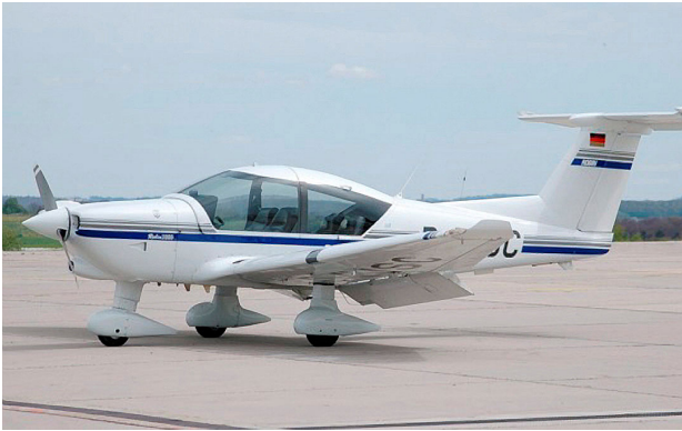
Canopy Cover for the Robin 3140 & R-3000

the hottest of days. It is water, ice and snow repellent, yet breathable to allow moisture to escape from between the cover and the aircraft surface.