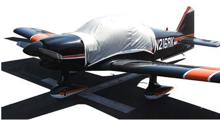
Robin R.2160 Canopy Cover