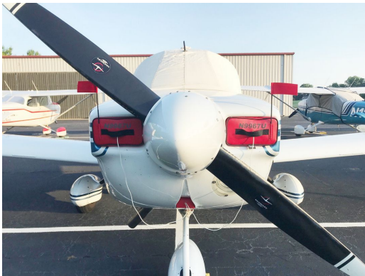
Grumman AA-5A Engine Inlet Plugs, Traveler models w/carb inlet plug (set of 3) on a

Engine Inlet Plugs are custom fit for your Robin 3140 & R-3000 intakes, made with heavy-duty vinyl material, and stuffed with a single block of sculpted urethane foam. Each plug has a zipper that allows the foam to be removed and dried if necessary. Engine plugs have warning flags that are visible from the cockpit or 'remove before flight' streamers sewn onto the face of the plugs. Most plugs are imprinted with the aircraft registration number in black for an extra charge. Storage bag NOT included. Engine plugs may be inserted after flight when the engine is still warm. Engine Inlet Plugs are commonly referred to as Cowl Plugs, Intake Plugs, Cowl Blocks, Engine Blocks, and Engine Bungs.