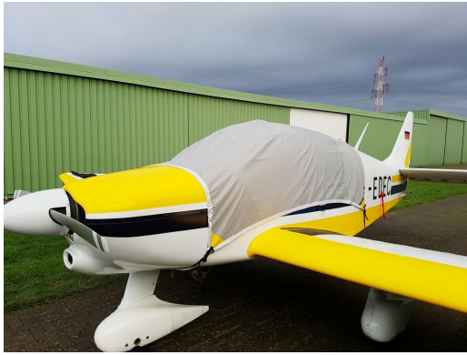
Robin DR400/R Travel Cover, Light Weight Travel Canopy Cover

the hottest of days. It is water, ice and snow repellent, yet breathable to allow moisture to escape from between the cover and the aircraft surface.