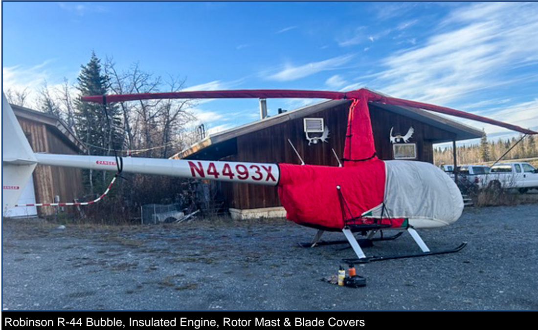
Robinson R-44 Bubble, Insulated Engine, Rotor Mast & Blade Covers