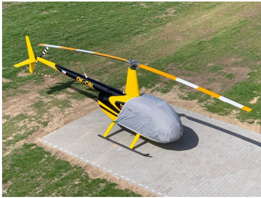
Robinson R-44 RAVEN I TRAVEL COVER

Travel Covers are made with Silver Solution-Dyed Polyester fabric and fully lined over the entire cover. The material is lightweight and more compact for easy storage in the aircraft. The polyester material is water resistant, but only intended for occasional use outside. We also have an ultra lightweight material available for fitted hangar dust covers. For daily outdoor use, the non-travel Sunbrella Cover is the best choice.