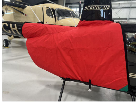
Robinson R-44 Insulated Engine Cover, also covers bottom