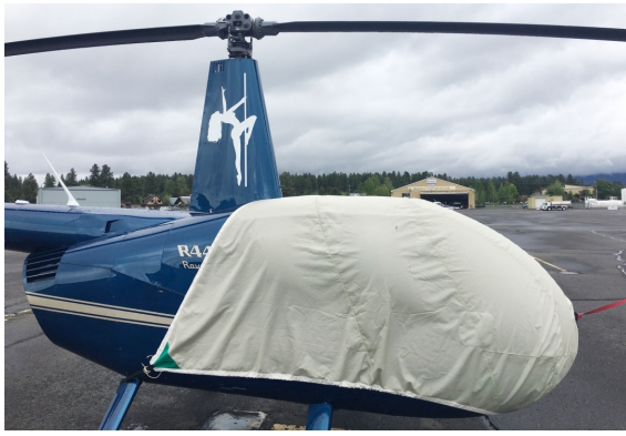
Robinson R-44 Bubble Cover, Strap Attachment Type