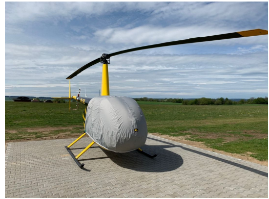
Robinson R-44 RAVEN I TRAVEL COVER