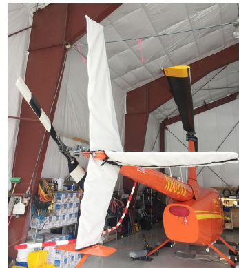
Robinson R-44/66 Horizontal & Vertical Stabilizer Covers