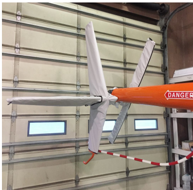
Robinson R-44 Tail Fins and Tail Rotor Covers

The Tailboom Cover details vary by model, but generally the helicopter tail boom cover encloses the tail boom from the "bottleneck" to the aft end. They usually also cover the horizontal stabilizers, and are custom made to allow for antennae, lights, and other protrusions. They attach with straps underneath the tail boom. Covers for the vertical and horizontal stabilizers are also available separately. Specific information for each model is available on request.