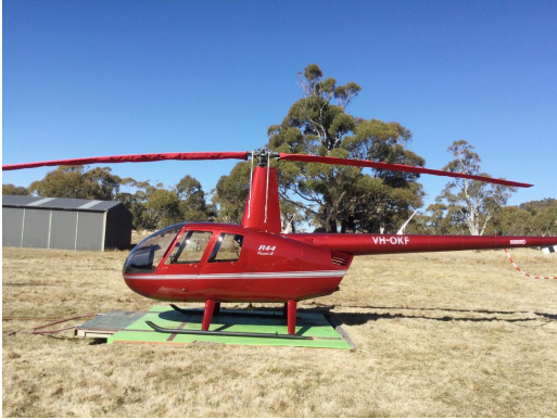
Robinson R-44 Blade Covers

WINTER USE MATERIAL - Made with Solution-Dyed Polyester fabric, this option is intended for seasonal use to aid in deicing, rain mitigation, or for occasional travel. The material is lighter and more compact, but more susceptible to UV damage and may have a shorter useful life if used continuously outside than the all-year use material.