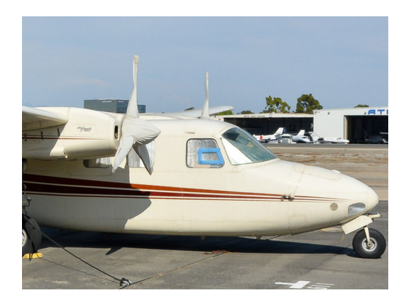
Aero Commander AC500 Ptopellor/Spinner Covers

This cover type is made from Silver Acrylic Sunbrella canvas and is 100% lined with a soft and smooth microfiber. Bruce's Custom Covers developed this material combination especially for aircraft protection. The outer material is medium weight and treated for water resistance, UV resistance and anti-static buildup. The inner lining is a very soft and smooth microfiber to prevent scratching. The material is very reflective, and tests show that the cabin interior temperature can be reduced to near-ambient temperature on the hottest of days. It is water, ice and snow repellent, yet breathable to allow moisture to escape from between the cover and the aircraft surface.