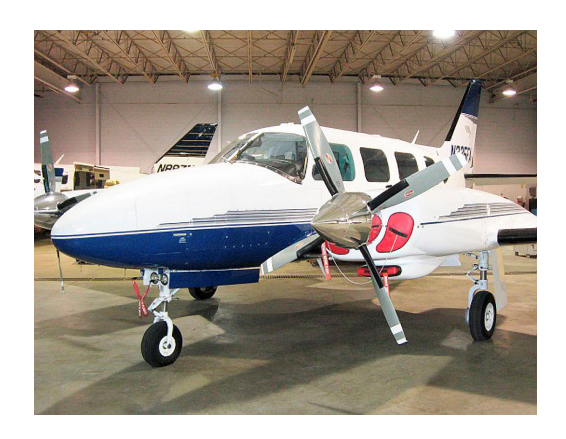
Piper Navajo PA31 Engine Inlet Plugs (Panther Conversion)