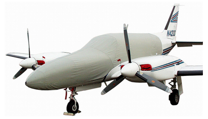
Piper Navajo CR Canopy/Nose Cover