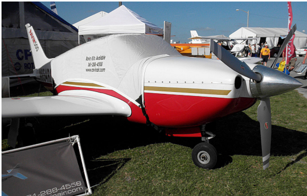
Ravin 500 Canopy Cover

This cover type is made from Silver Acrylic Sunbrella canvas and is 100% lined with a soft and smooth microfiber. Bruce's Custom Covers developed this material combination especially for aircraft protection. The outer material is medium weight and treated for water resistance, UV resistance and anti-static buildup. The inner lining is a very soft and smooth microfiber to prevent scratching. The material is very reflective, and tests show that the cabin interior temperature can be reduced to near-ambient temperature on the hottest of days. It is water, ice and snow repellent, yet breathable to allow moisture to escape from between the cover and the aircraft surface.