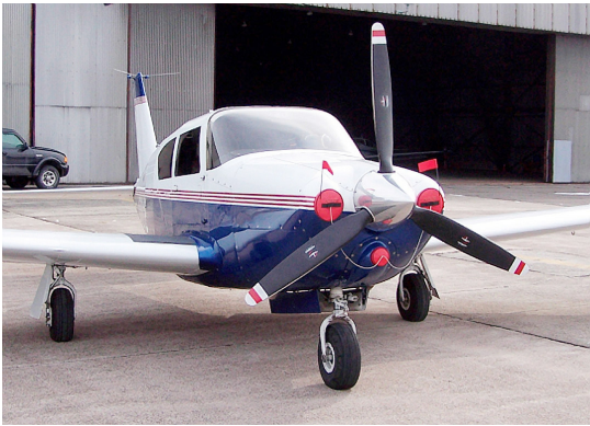
Piper Comanche Engine Plugs