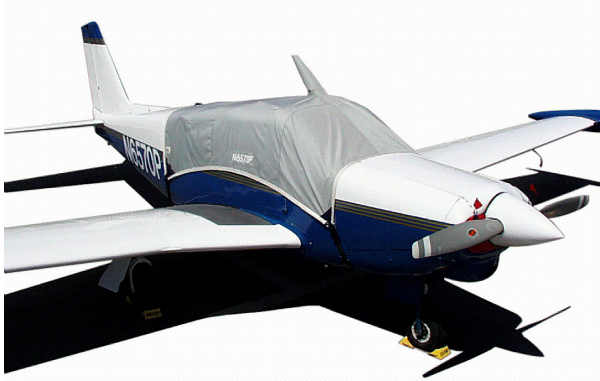
Piper Comanche Standard Canopy Cover & Engine Plugs

This cover type is made from Silver Acrylic Sunbrella canvas and is 100% lined with a soft and smooth microfiber. Bruce's Custom Covers developed this material combination especially for aircraft protection. The outer material is medium weight and treated for water resistance, UV resistance and anti-static buildup. The inner lining is a very soft and smooth microfiber to prevent scratching. The material is very reflective, and tests show that the cabin interior temperature can be reduced to near-ambient temperature on the hottest of days. It is water, ice and snow repellent, yet breathable to allow moisture to escape from between the cover and the aircraft surface.