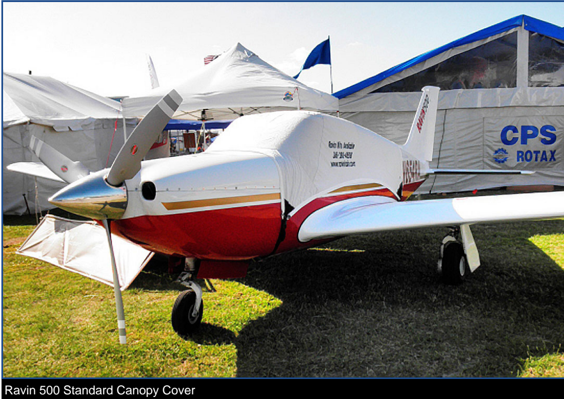
Ravin 500 Standard Canopy Cover