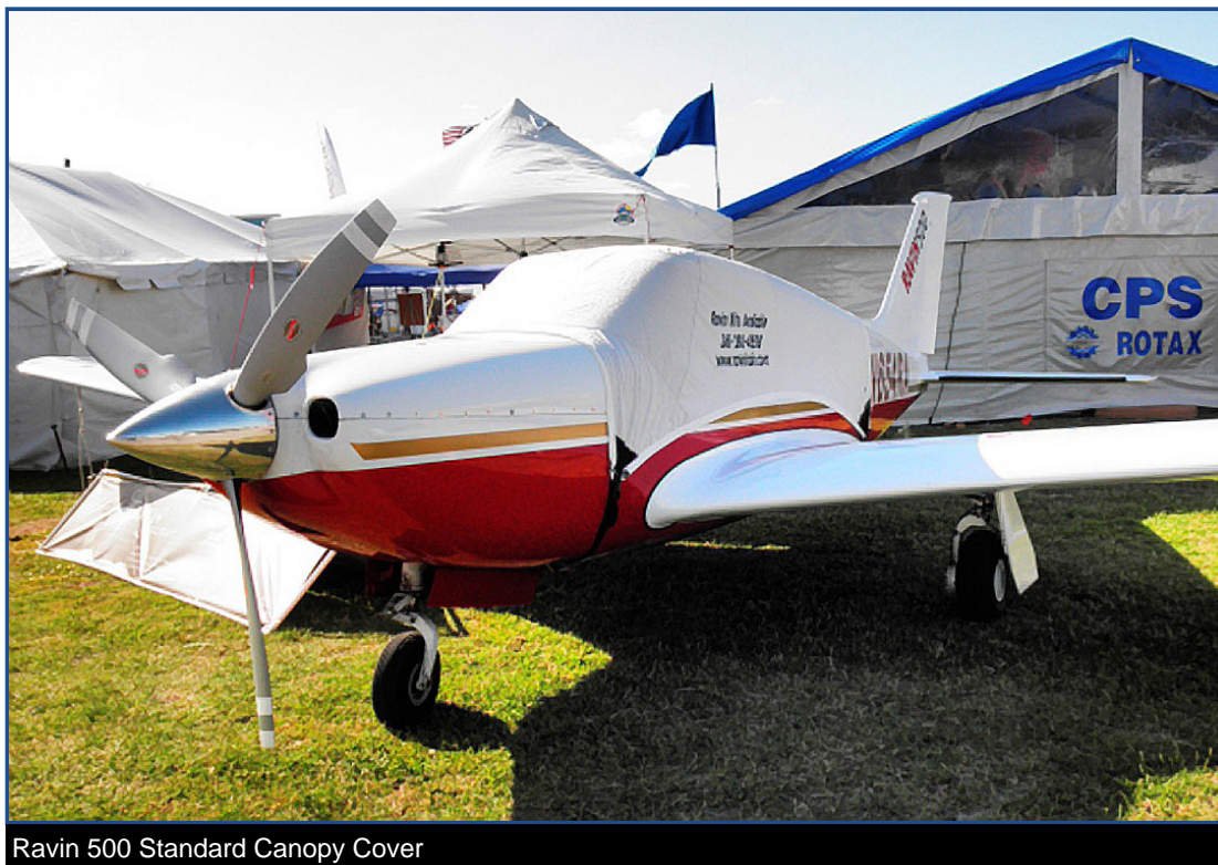
Ravin 500 Standard Canopy Cover