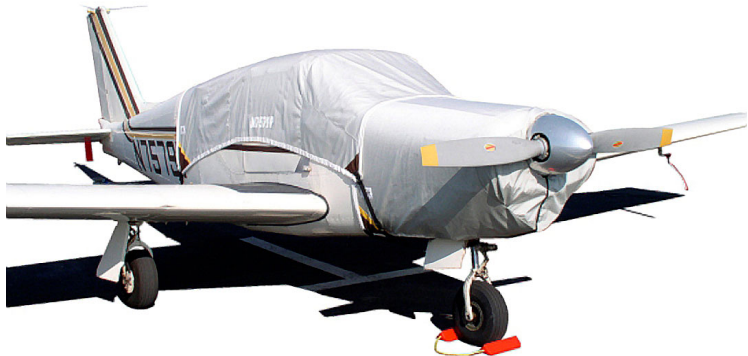
Piper Comanche Canopy & Engine Covers