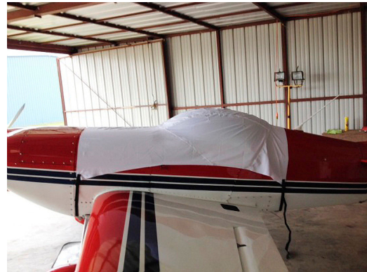
IAC One Design Canopy Cover, test fit cover