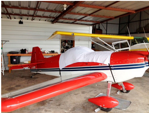
IAC One Design Canopy Cover, test fit cover

This cover type is made from Silver Acrylic Sunbrella canvas and is 100% lined with a soft and smooth microfiber. Bruce's Custom Covers developed this material combination especially for aircraft protection. The outer material is medium weight and treated for water resistance, UV resistance and anti-static buildup. The inner lining is a very soft and smooth microfiber to prevent scratching. The material is very reflective, and tests show that the cabin interior temperature can be reduced to near-ambient temperature on the hottest of days. It is water, ice and snow repellent, yet breathable to allow moisture to escape from between the cover and the aircraft surface.