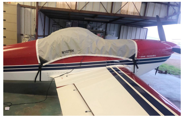
IAC One Design Travel Weight Canopy Cover