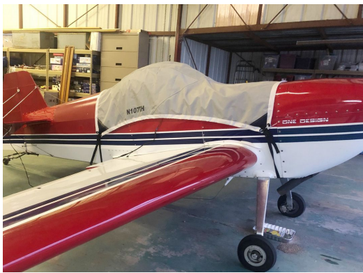
IAC One Design Travel Weight Canopy Cover

Travel Covers are made with Silver Solution-Dyed Polyester fabric and only lined over the windshield to save weight. The material is lightweight and more compact for easy stowage in the aircraft. The polyester material is water resistant, but only intended for occasional use outside. We also have an ultra lightweight material available for fitted hangar dust covers. For daily outdoor use, the non-travel Sunbrella Cover is the best choice.