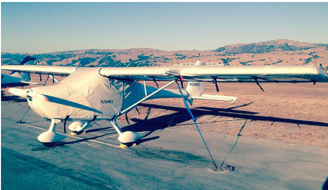
Remos Extended Canopy/Engine, Wing Covers

This cover type is made from Silver Acrylic Sunbrella canvas and is 100% lined with a soft and smooth microfiber. Bruce's Custom Covers developed this material combination especially for aircraft protection. The outer material is medium weight and treated for water resistance, UV resistance and anti-static buildup. The inner lining is a very soft and smooth microfiber to prevent scratching. The material is very reflective, and tests show that the cabin interior temperature can be reduced to near-ambient temperature on the hottest of days. It is water, ice and snow repellent, yet breathable to allow moisture to escape from between the cover and the aircraft surface.