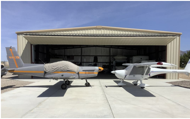
G-3/600 Travel Cover and Zlin 142 Canopy Cover