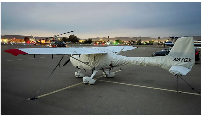
Remos RG-3 Complete Cover Set

This cover type is made from Silver Acrylic Sunbrella canvas and is 100% lined with a soft and smooth microfiber. Bruce's Custom Covers developed this material combination especially for aircraft protection. The outer material is medium weight and treated for water resistance, UV resistance and anti-static buildup. The inner lining is a very soft and smooth microfiber to prevent scratching. The material is very reflective, and tests show that the cabin interior temperature can be reduced to near-ambient temperature on the hottest of days. It is water, ice and snow repellent, yet breathable to allow moisture to escape from between the cover and the aircraft surface.