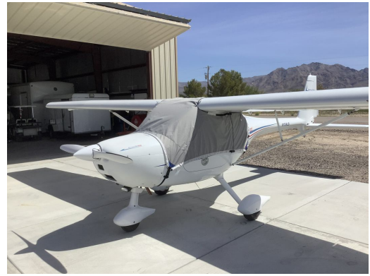
Remos G-3/600 Travel Cover