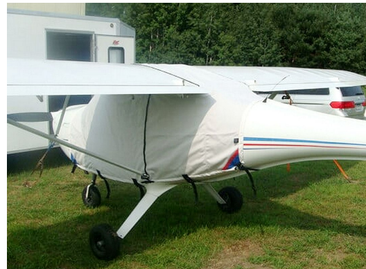
Remos G3 & GX MODELS Extended Canopy Cover (Over-The-Top Style)