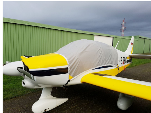
Robin DR400/R Travel Cover, Light Weight Travel Canopy Cover