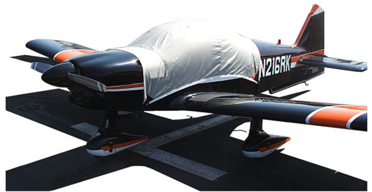
Robin R.2160 Canopy Cover