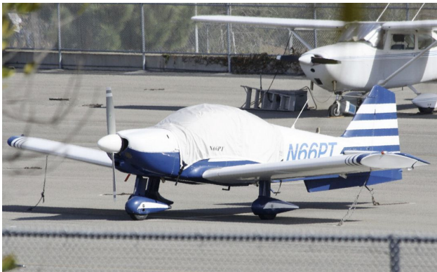
Robin R-2160 Canopy Cover with 12" forward Extension

This cover type is made from Silver Acrylic Sunbrella canvas and is 100% lined with a soft and smooth microfiber. Bruce's Custom Covers developed this material combination especially for aircraft protection. The outer material is medium weight and treated for water resistance, UV resistance and anti-static buildup. The inner lining is a very soft and smooth microfiber to prevent scratching. The material is very reflective, and tests show that the cabin interior temperature can be reduced to near-ambient temperature on the hottest of days. It is water, ice and snow repellent, yet breathable to allow moisture to escape from between the cover and the aircraft surface.