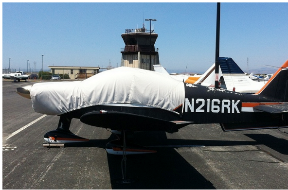
Robin Canopy/Engine Cover

Travel Covers are made with Silver Solution-Dyed Polyester fabric and only lined over the windshield to save weight. The material is lightweight and more compact for easy stowage in the aircraft. The polyester material is water resistant, but only intended for occasional use outside. We also have an ultra lightweight material available for fitted hangar dust covers. For daily outdoor use, the non-travel Sunbrella Cover is the best choice.