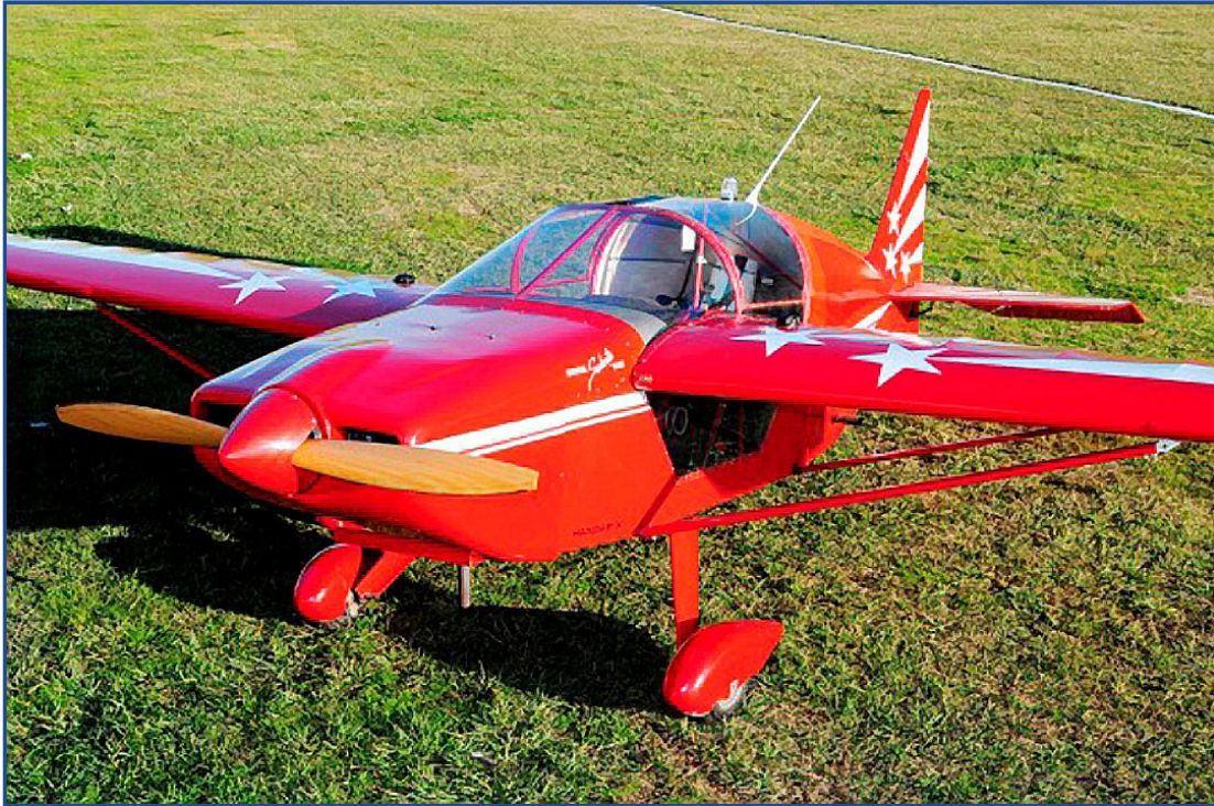
Covers, plugs &amp; related items for the Rans S-10 Sakota