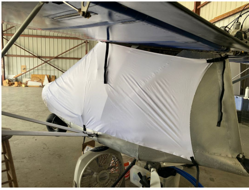
Rans S-12 Canopy/Nose Cover, test fit