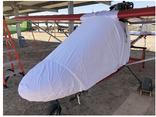
Rans S-12 Airaile Canopy/Nose Cover (test fit cover)