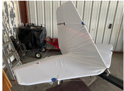
Rans S-12 Empennage Cover, test fit