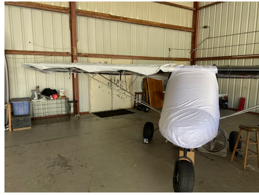
Rans S-12 Canopy/Nose & Wing Covers, test fit