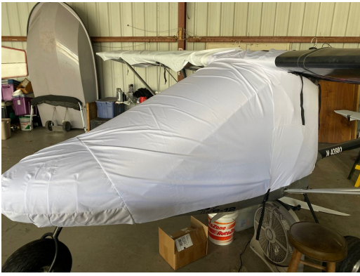
Rans S-12 Canopy/Nose Cover, test fit