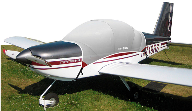
Rans S-19 Canopy Cover (illustration)

This cover type is made from Silver Acrylic Sunbrella canvas and is 100% lined with a soft and smooth microfiber. Bruce's Custom Covers developed this material combination especially for aircraft protection. The outer material is medium weight and treated for water resistance, UV resistance and anti-static buildup. The inner lining is a very soft and smooth microfiber to prevent scratching. The material is very reflective, and tests show that the cabin interior temperature can be reduced to near-ambient temperature on the hottest of days. It is water, ice and snow repellent, yet breathable to allow moisture to escape from between the cover and the aircraft surface.