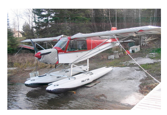
FOR INTERIOR USE. Cub Crafters CC-11 Insulated Hangar Blanket, Rans S-7 Insulated Engine, Wing and Horizontal Stabilizer available in Red or Silver Covers