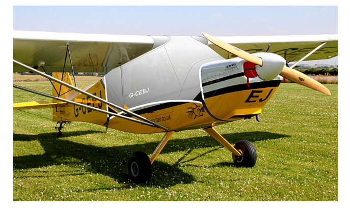
Rans Canopy Cover & Engine Plugs (illustration on a Rans S-7)