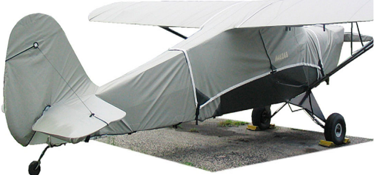
Prop Cover, Engine Cover, Canopy Cover, Wing Covers and Empennage Cover