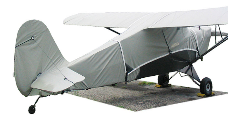
Piper J-3 Extended Canopy Cover