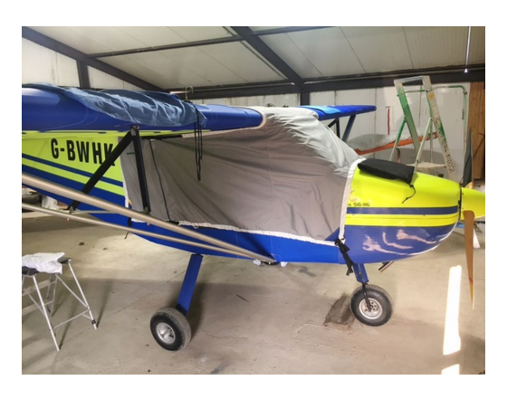
Rans S-6 Coyote Light Weight Travel Canopy Cover

Travel Covers are made with Silver Solution-Dyed Polyester fabric and only lined over the windshield to save weight. The material is lightweight and more compact for easy stowage in the aircraft. The polyester material is water resistant, but only intended for occasional use outside. We also have an ultra lightweight material available for fitted hangar dust covers. For daily outdoor use, the non-travel Sunbrella Cover is the best choice.