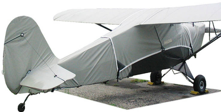
Taylorcraft L-2 Grasshopper Prop, Engine, Canopy, Wing and Empennage Covers