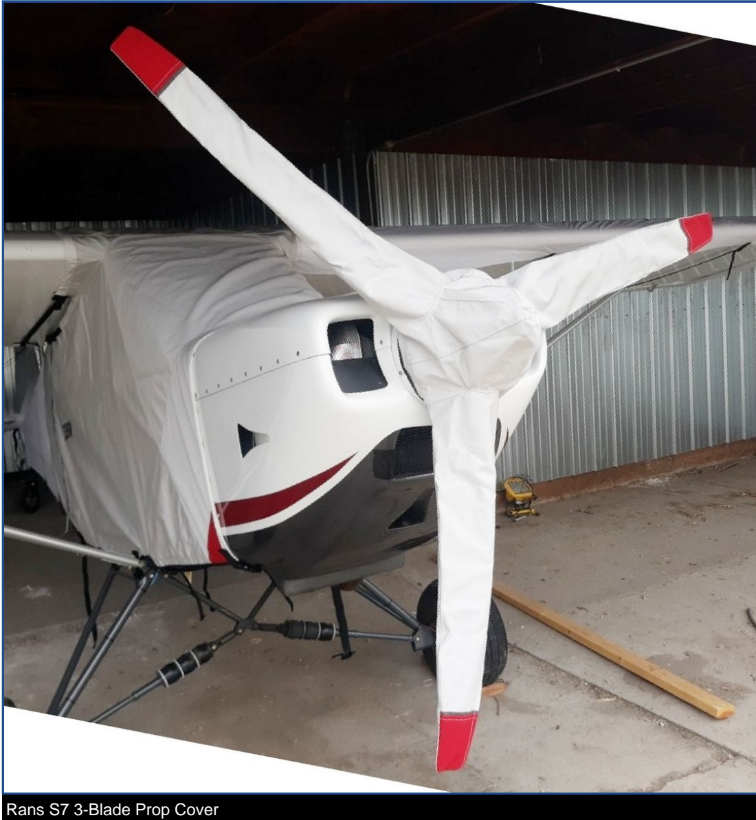
Rans S7 3-Blade Prop Cover