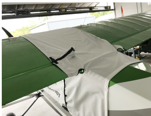
Rans Canopy Cover & Engine Plugs (illustration on a Rans S-7)