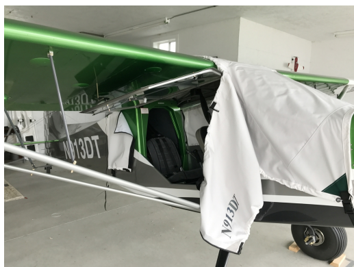
Rans S-7 Courier Canopy Cover (Over-The-Top Style), Belly Strap Type, Lsa Model (S7-S)

This cover type is made from Silver Acrylic Sunbrella canvas and is 100% lined with a soft and smooth microfiber. Bruce's Custom Covers developed this material combination especially for aircraft protection. The outer material is medium weight and treated for water resistance, UV resistance and anti-static buildup. The inner lining is a very soft and smooth microfiber to prevent scratching. The material is very reflective, and tests show that the cabin interior temperature can be reduced to near-ambient temperature on the hottest of days. It is water, ice and snow repellent, yet breathable to allow moisture to escape from between the cover and the aircraft surface.