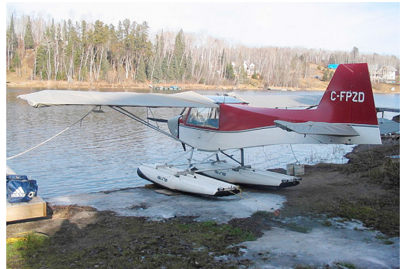
Rans S-7 Insulated Engine Cover, Wing Covers and Horizontal Stabilizer Covers