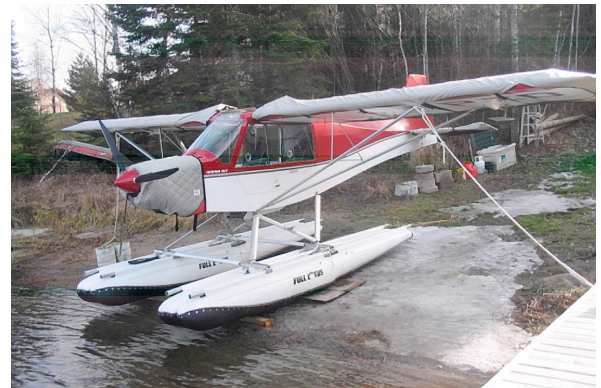
FOR INTERIOR USE. Cub Crafters CC-11 Insulated Hangar Blanket, Rans S-7 Insulated Engine, Wing and Horizontal Stabilizer Covers available in Red or Silver