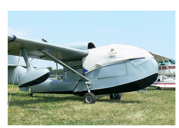
Republic Seabee Canopy Cover