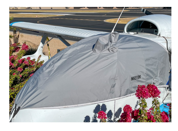
Seabee Amphibian Travel Cover, Light Weight Canopy Cover

This cover type is made from Silver Acrylic Sunbrella canvas and is 100% lined with a soft and smooth microfiber. Bruce's Custom Covers developed this material combination especially for aircraft protection. The outer material is medium weight and treated for water resistance, UV resistance and anti-static buildup. The inner lining is a very soft and smooth microfiber to prevent scratching. The material is very reflective, and tests show that the cabin interior temperature can be reduced to near-ambient temperature on the hottest of days. It is water, ice and snow repellent, yet breathable to allow moisture to escape from between the cover and the aircraft surface.