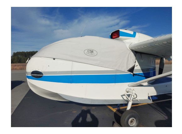
Republic Seabee Canopy Cover

The material is very reflective, and tests show that the cabin interior temperature can be reduced to near-ambient temperature on the hottest of days. It is water, ice and snow repellent, yet breathable to allow moisture to escape from between the cover and the aircraft surface.