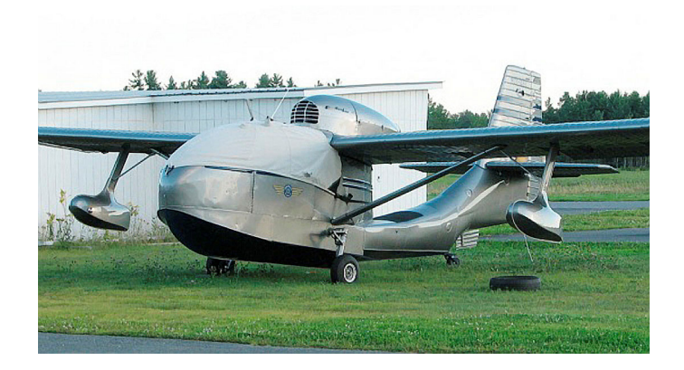
Seabee Canopy Cover