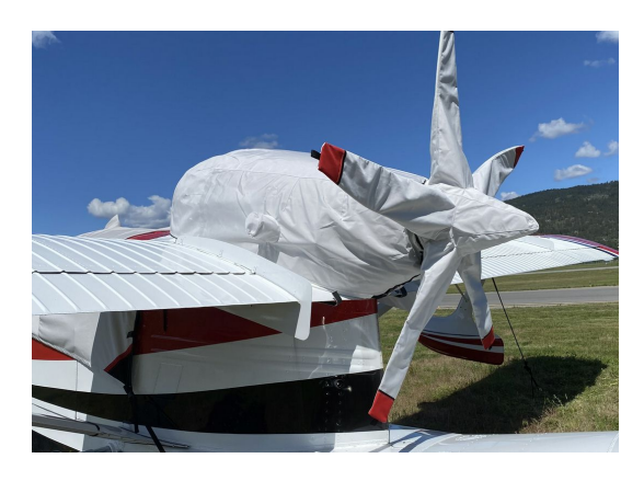
Republic Seabee Canopy, Engine, Prop Cover (5-blade)

water resistance, UV resistance and anti-static buildup. The inner lining is a very soft and smooth microfiber to prevent scratching. The material is very reflective, and tests show that the cabin interior temperature can be reduced to near-ambient temperature on the hottest of days. It is water, ice and snow repellent, yet breathable to allow moisture to escape from between the cover and the aircraft surface.