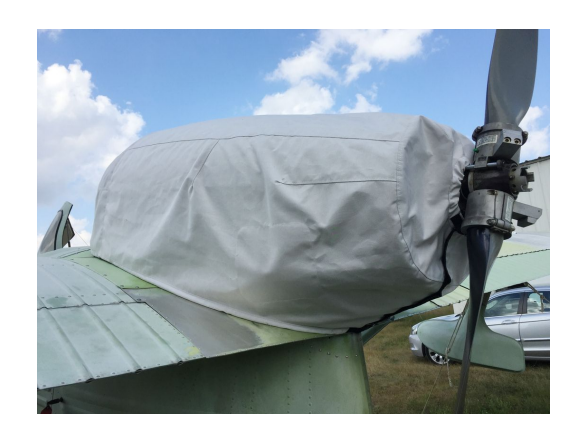
Republic Seabee Engine Cover