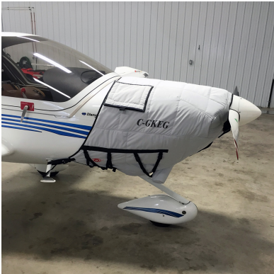
Diamond DA-20-C1 Insulated Engine Cover