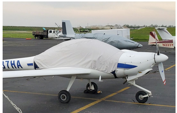
Diamond DA-20 Katana