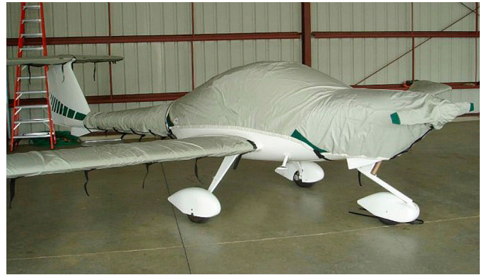
DA-20 Canopy/Engine, Prop/Spinner, Wing, Tailboom, Horiz. Stab. Covers