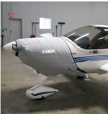
Diamond DA-20-C1 Insulated Engine Cover

This cover type is made from Silver Acrylic Sunbrella canvas and is 100% lined with a soft and smooth microfiber. Bruce's Custom Covers developed this material combination especially for aircraft protection. The outer material is medium weight and treated for water resistance, UV resistance and anti-static buildup. The inner lining is a very soft and smooth microfiber to prevent scratching. The material is very reflective, and tests show that the cabin interior temperature can be reduced to near-ambient temperature on the hottest of days. It is water, ice and snow repellent, yet breathable to allow moisture to escape from between the cover and the aircraft surface.