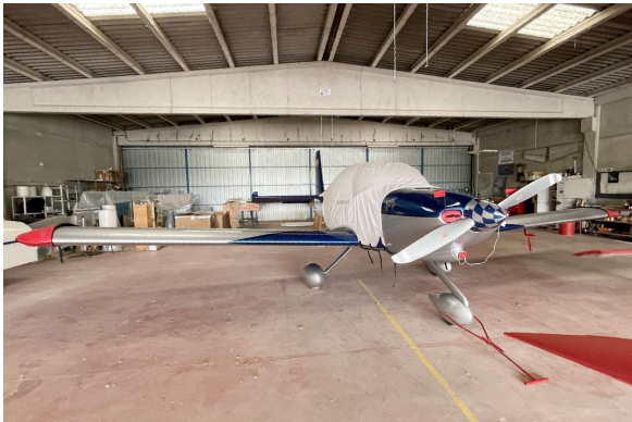
Van's RV-10 Extended Canopy Cover, Wingtip Pads, Engine Plugs

Engine Inlet Plugs are custom fit for your Van's Aircraft RV-10 intakes, made with heavy-duty vinyl material, and stuffed with a single block of sculpted urethane foam. Each plug has a zipper that allows the foam to be removed and dried if necessary. Engine plugs have warning flags that are visible from the cockpit or 'remove before flight' streamers sewn onto the face of the plugs. Most plugs are imprinted with the aircraft registration number in black for an extra charge. Storage bag NOT included. Engine plugs may be inserted after flight when the engine is still warm. Engine Inlet Plugs are commonly referred to as Cowl Plugs, Intake Plugs, Cowl Blocks, Engine Blocks, and Engine Bungs.