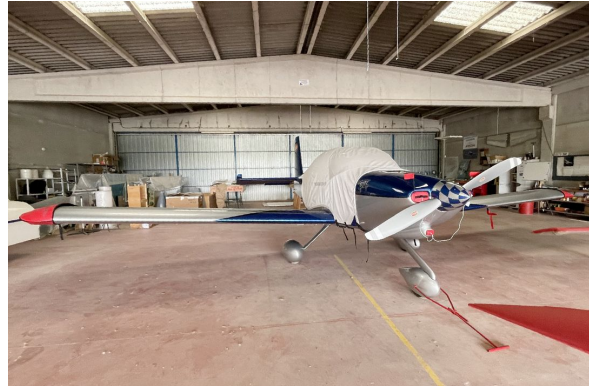
Van's RV-10 Extended Canopy Cover, Wingtip Pads, Engine Plugs