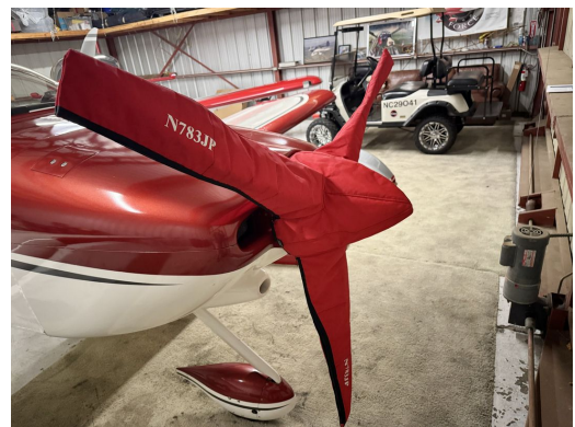
Van's RV-9 Insulated Prop Cover, 3-Blade