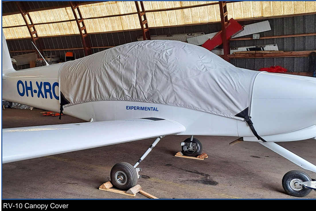
RV-10 Canopy Cover