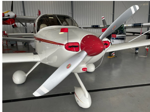
Van's RV-10 Engine Inlet Plugs