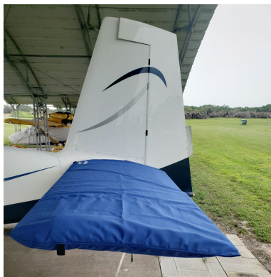
Van's RV-10 Horizontal Stabilizer Covers