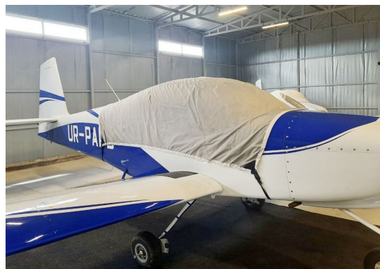
Van's RV-10 Travel Weight Canopy Cover