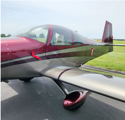
RV-10 Air Vent Wedge Plugs

Engine Inlet Plugs are custom fit for your Van's Aircraft RV-10 intakes, made with heavy-duty vinyl material, and stuffed with a single block of sculpted urethane foam. Each plug has a zipper that allows the foam to be removed and dried if necessary. Engine plugs have warning flags that are visible from the cockpit or 'remove before flight' streamers sewn onto the face of the plugs. Most plugs are imprinted with the aircraft registration number in black for an extra charge. Storage bag NOT included. Engine plugs may be inserted after flight when the engine is still warm. Engine Inlet Plugs are commonly referred to as Cowl Plugs, Intake Plugs, Cowl Blocks, Engine Blocks, and Engine Bunges.