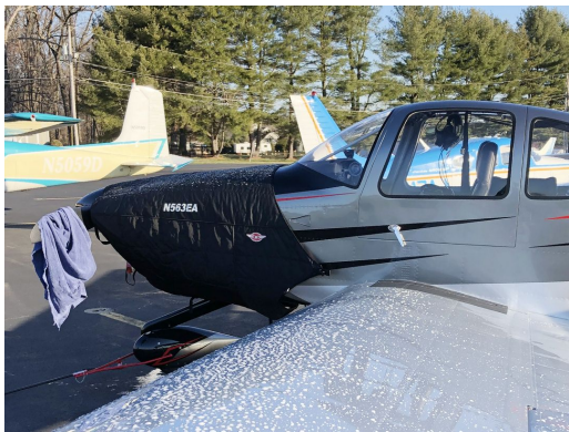
Van's RV-10 Insulated Engine Cover

This cover type is made from Silver Acrylic Sunbrella canvas and is 100% lined with a soft and smooth microfiber. Bruce's Custom Covers developed this material combination especially for aircraft protection. The outer material is medium weight and treated for water resistance, UV resistance and anti-static buildup. The inner lining is a very soft and smooth microfiber to prevent scratching. The material is very reflective, and tests show that the cabin interior temperature can be reduced to near-ambient temperature on the hottest of days. It is water, ice and snow repellent, yet breathable to allow moisture to escape from between the cover and the aircraft surface.