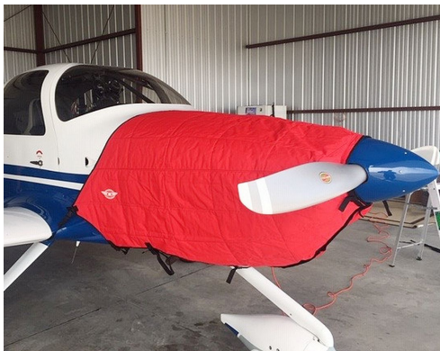
Van's RV-10 Insulated Engine Cover

This cover type is made from Silver Acrylic Sunbrella canvas and is 100% lined with a soft and smooth microfiber. Bruce's Custom Covers developed this material combination especially for aircraft protection. The outer material is medium weight and treated for water resistance, UV resistance and anti-static buildup. The inner lining is a very soft and smooth microfiber to prevent scratching. The material is very reflective, and tests show that the cabin interior temperature can be reduced to near-ambient temperature on the hottest of days. It is water, ice and snow repellent, yet breathable to allow moisture to escape from between the cover and the aircraft surface.