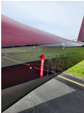
RV-10 Air Vent Wedge Plugs

Engine Inlet Plugs are custom fit for your Van's Aircraft RV-10 intakes, made with heavy-duty vinyl material, and stuffed with a single block of sculpted urethane foam. Each plug has a zipper that allows the foam to be removed and dried if necessary. Engine plugs have warning flags that are visible from the cockpit or 'remove before flight' streamers sewn onto the face of the plugs. Most plugs are imprinted with the aircraft registration number in black for an extra charge. Storage bag NOT included. Engine plugs may be inserted after flight when the engine is still warm. Engine Inlet Plugs are commonly referred to as Cowl Plugs, Intake Plugs, Cowl Blocks, Engine Blocks, and Engine Bungs.