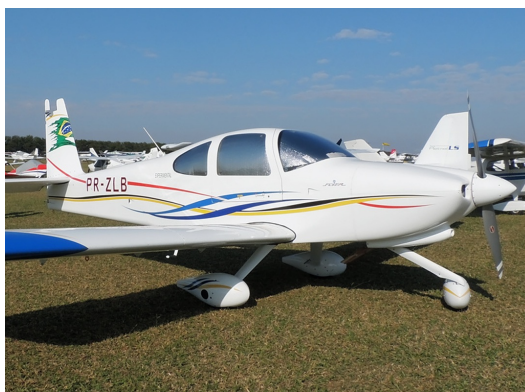
Van's RV-10 HeatShield Set