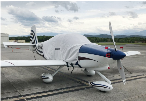
Van's RV-10 Extended Canopy Cover

This cover type is made from Silver Acrylic Sunbrella canvas and is 100% lined with a soft and smooth microfiber. Bruce's Custom Covers developed this material combination especially for aircraft protection. The outer material is medium weight and treated for water resistance, UV resistance and anti-static buildup. The inner lining is a very soft and smooth microfiber to prevent scratching. The material is very reflective, and tests show that the cabin interior temperature can be reduced to near-ambient temperature on the hottest of days. It is water, ice and snow repellent, yet breathable to allow moisture to escape from between the cover and the aircraft surface.