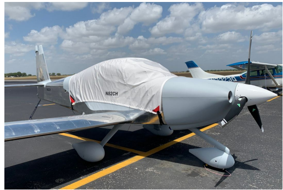
RV-10 Canopy Cover