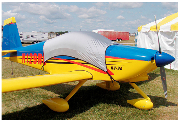
Van's RV-9A Light Weight Travel-Cover

Travel Covers are made with Silver Solution-Dyed Polyester fabric and only lined over the windshield to save weight. The material is lightweight and more compact for easy stowage in the aircraft. The polyester material is water resistant, but only intended for occasional use outside. We also have an ultra lightweight material available for fitted hangar dust covers. For daily outdoor use, the non-travel Sunbrella Cover is the best choice.