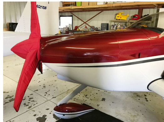
Van's RV-9 Insulated Prop Cover, 3-blade