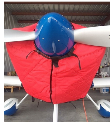
Van's RV-10 Insulated Engine Cover