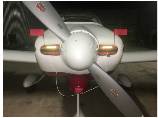
Van's Aircraft RV-7A Engine Inlet Plugs