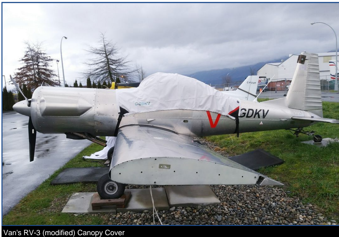
Van's RV-3 (modified) Canopy Cover