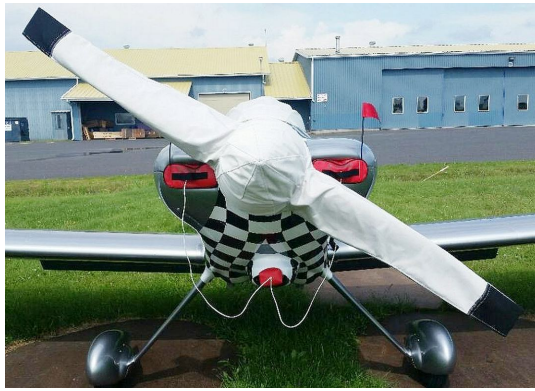
Van's RV-3 Engine Plugs, Prop/Spinner Cover