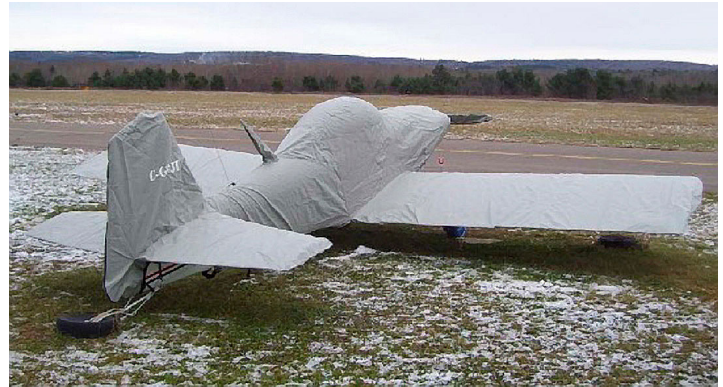
Van's RV-4 Complete Fuselage/Wing/Tail Surfaces cover