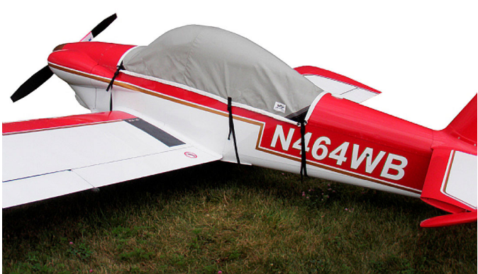
Vans's RV-3 Canopy Cover