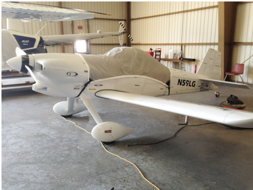
Van's RV-3 Light Weight Travel Cover