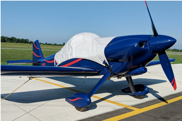
Van's RV-3 Canopy Cover

This cover type is made from Silver Acrylic Sunbrella canvas and is 100% lined with a soft and smooth microfiber. Bruce's Custom Covers developed this material combination especially for aircraft protection. The outer material is medium weight and treated for water resistance, UV resistance and anti-static buildup. The inner lining is a very soft and smooth microfiber to prevent scratching. The material is very reflective, and tests show that the cabin interior temperature can be reduced to near-ambient temperature on the hottest of days. It is water, ice and snow repellent, yet breathable to allow moisture to escape from between the cover and the aircraft surface.