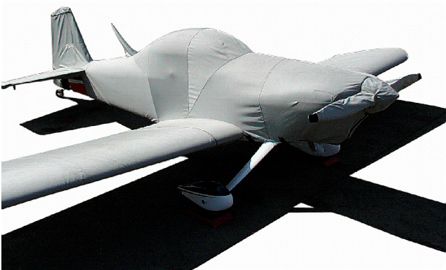
Van's RV-4 Complete Cover