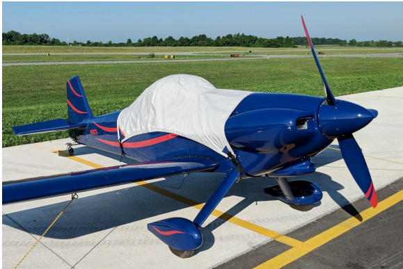
Van's RV-3 Canopy Cover

This cover type is made from Silver Acrylic Sunbrella canvas and is 100% lined with a soft and smooth microfiber. Bruce's Custom Covers developed this material combination especially for aircraft protection. The outer material is medium weight and treated for water resistance, UV resistance and anti-static buildup. The inner lining is a very soft and smooth microfiber to prevent scratching. The material is very reflective, and tests show that the cabin interior temperature can be reduced to near-ambient temperature on the hottest of days. It is water, ice and snow repellent, yet breathable to allow moisture to escape from between the cover and the aircraft surface.