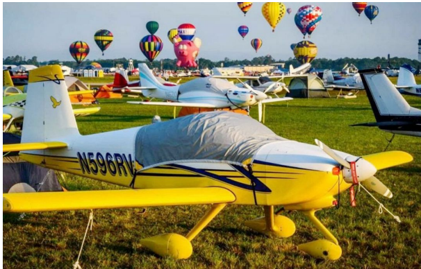
Vans's RV-9 Travel Weight Canopy Cover at Sun 'n Fun

Travel Covers are made with Silver Solution-Dyed Polyester fabric and only lined over the windshield to save weight. The material is lightweight and more compact for easy stowage in the aircraft. The polyester material is water resistant, but only intended for occasional use outside. We also have an ultra lightweight material available for fitted hangar dust covers. For daily outdoor use, the non-travel Sunbrella Cover is the best choice.