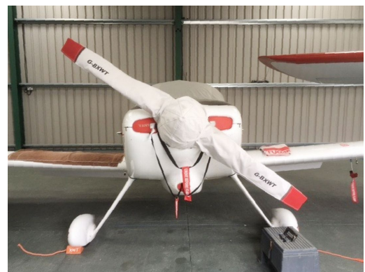
Van's RV-6 Prop/Spinner Cover