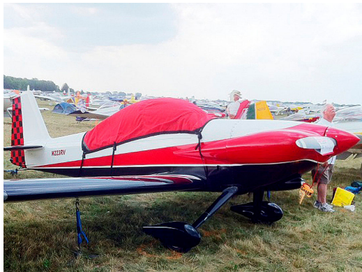
Vans's RV-4 Canopy Cover

This cover type is made from Silver Acrylic Sunbrella canvas and is 100% lined with a soft and smooth microfiber. Bruce's Custom Covers developed this material combination especially for aircraft protection. The outer material is medium weight and treated for water resistance, UV resistance and anti-static buildup. The inner lining is a very soft and smooth microfiber to prevent scratching. The material is very reflective, and tests show that the cabin interior temperature can be reduced to near-ambient temperature on the hottest of days. It is water, ice and snow repellent, yet breathable to allow moisture to escape from between the cover and the aircraft surface.