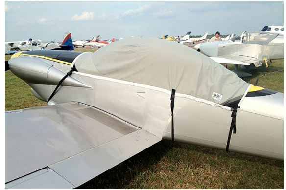
Van's RV-4 Canopy Cover