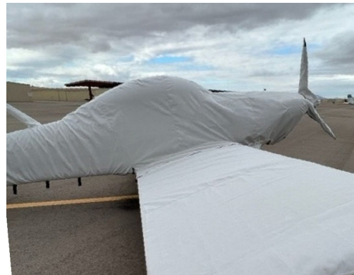
Vans RV-8 Complete Cover Set