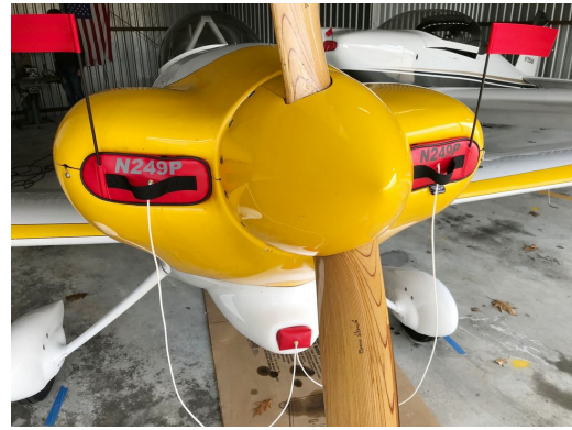
Van's RV-4 Engine Inlet Plugs