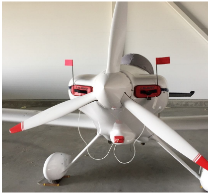
Van's RV-4 Engine Inlet Plugs

Engine Inlet Plugs are custom fit for your Van's Aircraft RV-4 intakes, made with heavy-duty vinyl material, and stuffed with a single block of sculpted urethane foam. Each plug has a zipper that allows the foam to be removed and dried if necessary. Engine plugs have warning flags that are visible from the cockpit or 'remove before flight' streamers sewn onto the face of the plugs. Most plugs are imprinted with the aircraft registration number in black for an extra charge. Storage bag NOT included. Engine plugs may be inserted after flight when the engine is still warm. Engine Inlet Plugs are commonly referred to as Cowl Plugs, Intake Plugs, Cowl Blocks, Engine Blocks, and Engine Bungs.