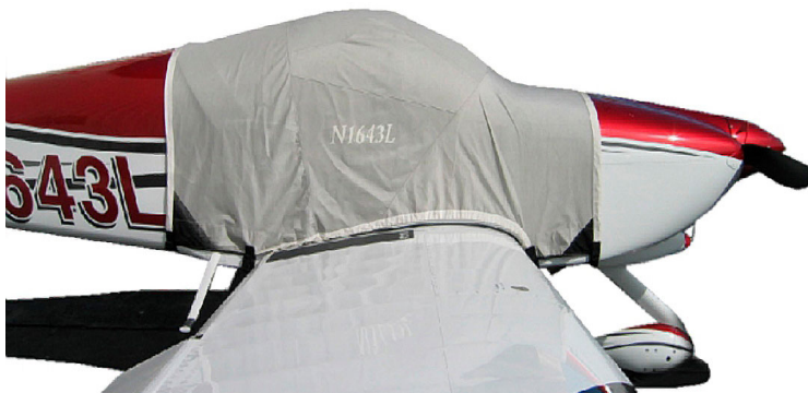
Van's RV-7A Extended Canopy Cover

This cover type is made from Silver Acrylic Sunbrella canvas and is 100% lined with a soft and smooth microfiber. Bruce's Custom Covers developed this material combination especially for aircraft protection. The outer material is medium weight and treated for water resistance, UV resistance and anti-static buildup. The inner lining is a very soft and smooth microfiber to prevent scratching. The material is very reflective, and tests show that the cabin interior temperature can be reduced to near-ambient temperature on the hottest of days. It is water, ice and snow repellent, yet breathable to allow moisture to escape from between the cover and the aircraft surface.