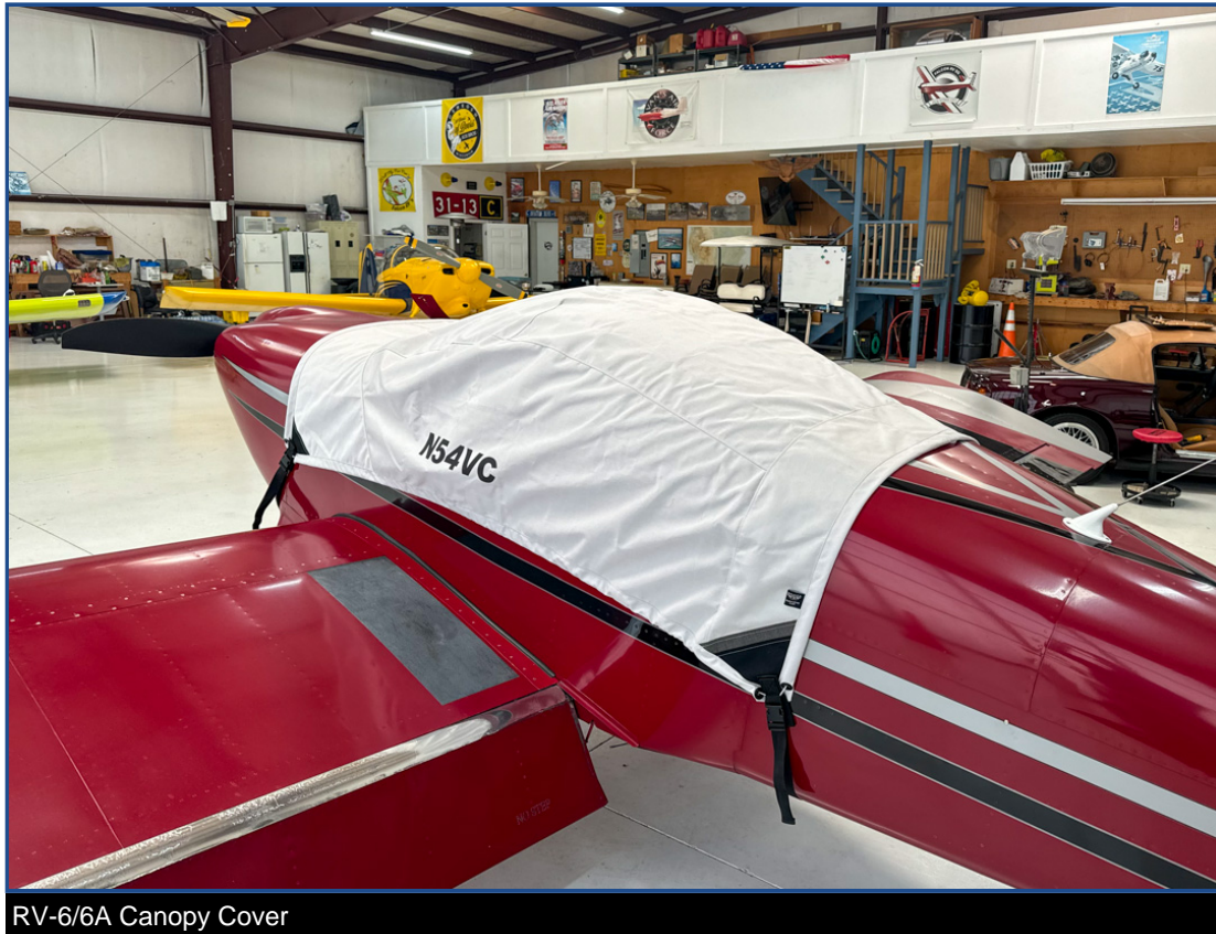
RV-6/6A Canopy Cover