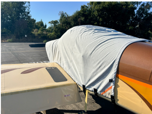
Van's Aircraft RV-6/6A Extended Canopy/Engine Cover

This cover type is made from Silver Acrylic Sunbrella canvas and is 100% lined with a soft and smooth microfiber. Bruce's Custom Covers developed this material combination especially for aircraft protection. The outer material is medium weight and treated for water resistance, UV resistance and anti-static buildup. The inner lining is a very soft and smooth microfiber to prevent scratching. The material is very reflective, and tests show that the cabin interior temperature can be reduced to near-ambient temperature on the hottest of days. It is water, ice and snow repellent, yet breathable to allow moisture to escape from between the cover and the aircraft surface.