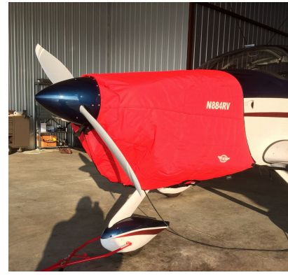
Van's RV-9A Insulated Engine Cover