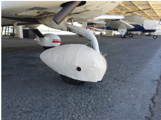
Grumman AA5 Nose Wheelpant Cover, test fit