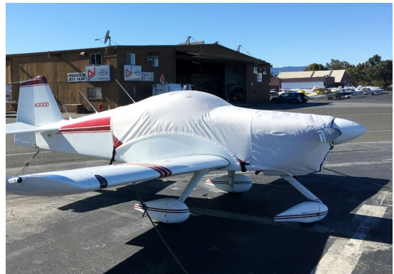
Van's RV-6A Canopy/Engine Cover