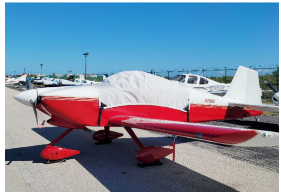
Van's RV-6A Canopy Cover