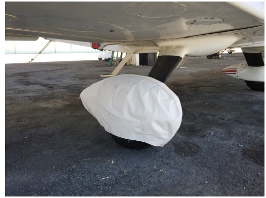
Grumman AA5 Main Wheelpant Cover, test fit