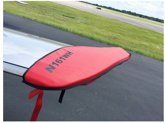
Cirrus SR-20/22 Wingtip Pads