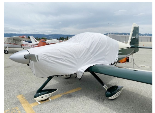
Van's RV-9A Extended Canopy/Engine Cover