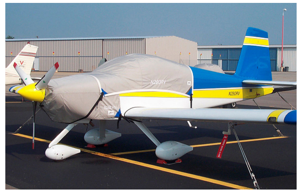
Van's RV-9 Canopy & Engine Covers