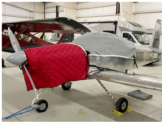
Vans RV-7 Travel Canopy Cover, Hangar Blanket