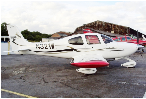
Cirrus SR-20/22 Wingtip Pads