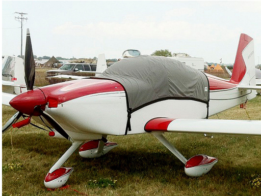
Van's RV-9 Travel Canopy Cover

Travel Covers are made with Silver Solution-Dyed Polyester fabric and only lined over the windshield to save weight. The material is lightweight and more compact for easy stowage in the aircraft. The polyester material is water resistant, but only intended for occasional use outside. We also have an ultra lightweight material available for fitted hangar dust covers. For daily outdoor use, the non-travel Sunbrella Cover is the best choice.