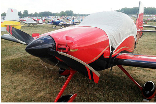
Van's RV-7 Canopy Cover & Engine Inlet Plugs