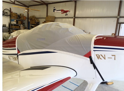
Van's RV-7 Travel Canopy Cover