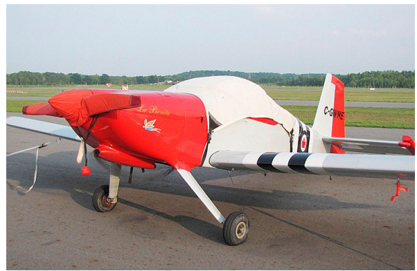
Van's RV-6 2-Blade Prop Cover