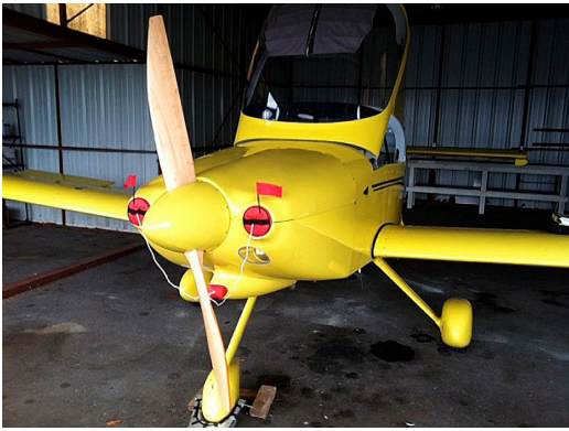
Van's RV-9A Engine Inlet Plugs