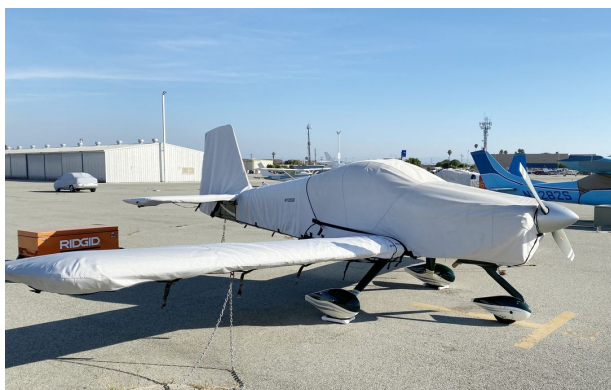
Van's RV-9A Extended Canopy/Engine, Wing & Empennage Covers

WINTER USE MATERIAL - Made with Solution-Dyed Polyester fabric, this option is intended for seasonal use to aid in deicing, rain mitigation, or for occasional travel. The material is lighter and more compact, but more susceptible to UV damage and may have a shorter useful life if used continuously outside than the all-year use material.