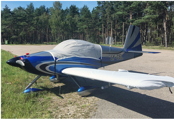
Van's RV-7/7A Travel and Wing Covers

WINTER USE MATERIAL - Made with Solution-Dyed Polyester fabric, this option is intended for seasonal use to aid in deicing, rain mitigation, or for occasional travel. The material is lighter and more compact, but more susceptible to UV damage and may have a shorter useful life if used continuously outside than the all-year use material.