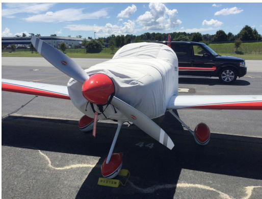
Van's RV-6A Extended Canopy/Engine Cover

This cover type is made from Silver Acrylic Sunbrella canvas and is 100% lined with a soft and smooth microfiber. Bruce's Custom Covers developed this material combination especially for aircraft protection. The outer material is medium weight and treated for water resistance, UV resistance and anti-static buildup. The inner lining is a very soft and smooth microfiber to prevent scratching. The material is very reflective, and tests show that the cabin interior temperature can be reduced to near-ambient temperature on the hottest of days. It is water, ice and snow repellent, yet breathable to allow moisture to escape from between the cover and the aircraft surface.