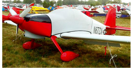
Light Weight Fitted Hangar Dust Cover