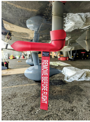
Van's RV-14 Pitot Cover