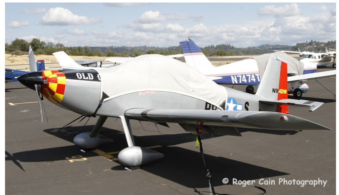
Van'ss RV-8 Canopy Cover