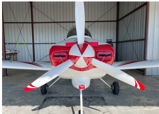
Van's RV-8 Engine Inlet Plugs