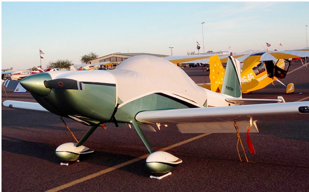
Van's RV-8 Canopy Cover