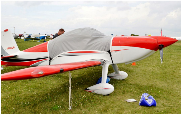
Van's RV-8 Travel Canopy Cover, Fastback Model