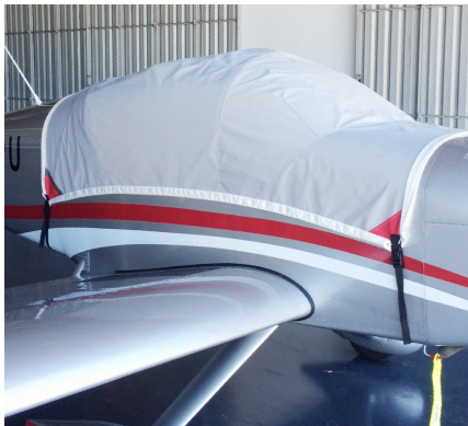
Vans's RV-9 Light Weight Travel Canopy Cover

Travel Covers are made with Silver Solution-Dyed Polyester fabric and only lined over the windshield to save weight. The material is lightweight and more compact for easy stowage in the aircraft. The polyester material is water resistant, but only intended for occasional use outside. We also have an ultra lightweight material available for fitted hangar dust covers. For daily outdoor use, the non-travel Sunbrella Cover is the best choice.