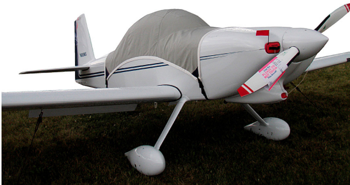
Van's RV-8 Canopy Cover & Engine Inlet Plugs

This cover type is made from Silver Acrylic Sunbrella canvas and is 100% lined with a soft and smooth microfiber. Bruce's Custom Covers developed this material combination especially for aircraft protection. The outer material is medium weight and treated for water resistance, UV resistance and anti-static buildup. The inner lining is a very soft and smooth microfiber to prevent scratching. The material is very reflective, and tests show that the cabin interior temperature can be reduced to near-ambient temperature on the hottest of days. It is water, ice and snow repellent, yet breathable to allow moisture to escape from between the cover and the aircraft surface.