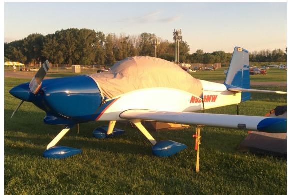
Van's' RV-8 Light Weight Travel Cover