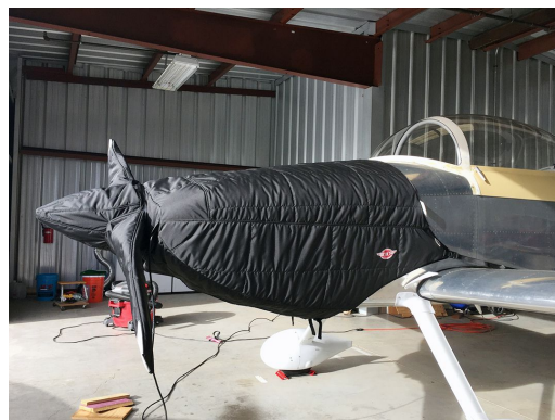
Van's RV-8 Insulated Prop and Engine Covers (sold separately)