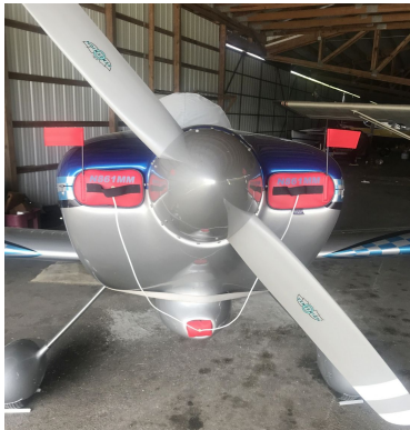
Van's RV-8 Engine Plugs