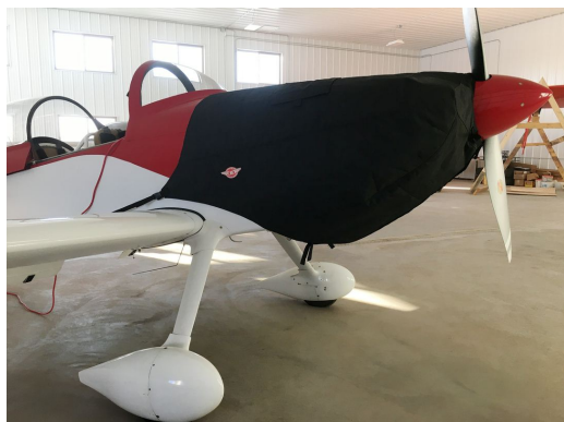
Van's RV-8 Insulated Engine Cover

This cover type is made from Silver Acrylic Sunbrella canvas and is 100% lined with a soft and smooth microfiber. Bruce's Custom Covers developed this material combination especially for aircraft protection. The outer material is medium weight and treated for water resistance, UV resistance and anti-static buildup. The inner lining is a very soft and smooth microfiber to prevent scratching. The material is very reflective, and tests show that the cabin interior temperature can be reduced to near-ambient temperature on the hottest of days. It is water, ice and snow repellent, yet breathable to allow moisture to escape from between the cover and the aircraft surface.