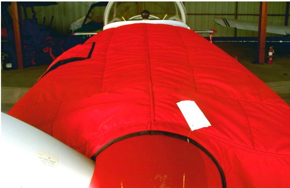
Van's RV-8/8A Insulated Engine Cover (From the Spinner Looking Aft)