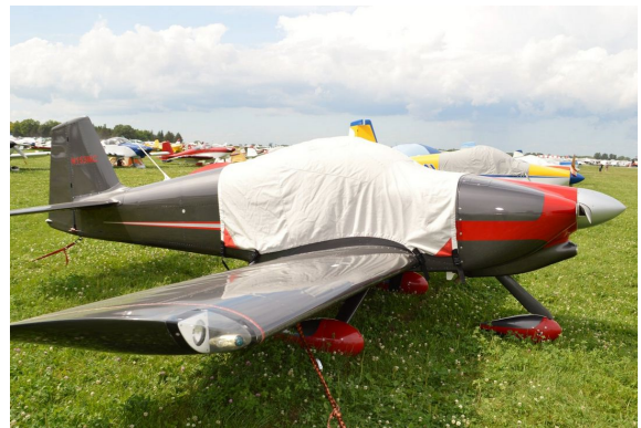
Van's RV-7A Extended Canopy Cover