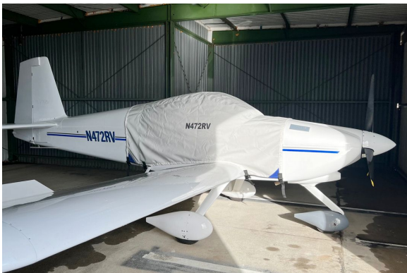
Van's RV-9A Extended Canopy Cover

This cover type is made from Silver Acrylic Sunbrella canvas and is 100% lined with a soft and smooth microfiber. Bruce's Custom Covers developed this material combination especially for aircraft protection. The outer material is medium weight and treated for water resistance, UV resistance and anti-static buildup. The inner lining is a very soft and smooth microfiber to prevent scratching. The material is very reflective, and tests show that the cabin interior temperature can be reduced to near-ambient temperature on the hottest of days. It is water, ice and snow repellent, yet breathable to allow moisture to escape from between the cover and the aircraft surface.