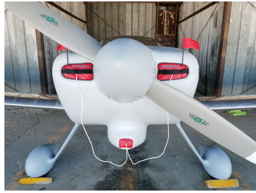
Van's RV-9 Engine Inlet Plugs