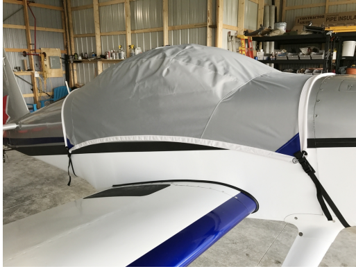
Van's Aircraft RV-9 Travel Cover, Light Weight Travel Canopy Cover

lightweight and more compact for easy stowage in the aircraft. The polyester material is water resistant, but only intended for occasional use outside. We also have an ultra lightweight material available for fitted hangar dust covers. For daily outdoor use, the non-travel Sunbrella Cover is the best choice.