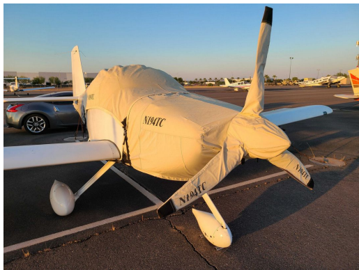
Van's RV-9 Canopy, Engine & Prop Covers

This cover type is made from Silver Acrylic Sunbrella canvas and is 100% lined with a soft and smooth microfiber. Bruce's Custom Covers developed this material combination especially for aircraft protection. The outer material is medium weight and treated for water resistance, UV resistance and anti-static buildup. The inner lining is a very soft and smooth microfiber to prevent scratching. The material is very reflective, and tests show that the cabin interior temperature can be reduced to near-ambient temperature on the hottest of days. It is water, ice and snow repellent, yet breathable to allow moisture to escape from between the cover and the aircraft surface.