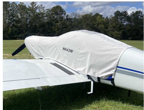
Van's RV-7 Extended Canopy/Engine Cover