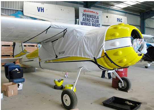
Cessna 195 Canopy Cover, over-top, 24" fwd ext to cover cowl ring gap, gas cap ext.

The material is very reflective, and tests show that the cabin interior temperature can be reduced to near-ambient temperature on the hottest of days. It is water, ice and snow repellent, yet breathable to allow moisture to escape from between the cover and the aircraft surface.