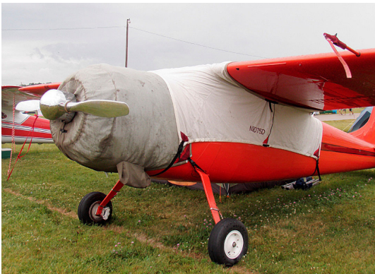
Cessna 195 Over-Top Canopy Cover & Engine Cover