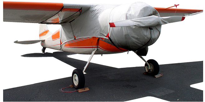
Cessna 195 Over-Top Canopy, Engine & Prop Covers