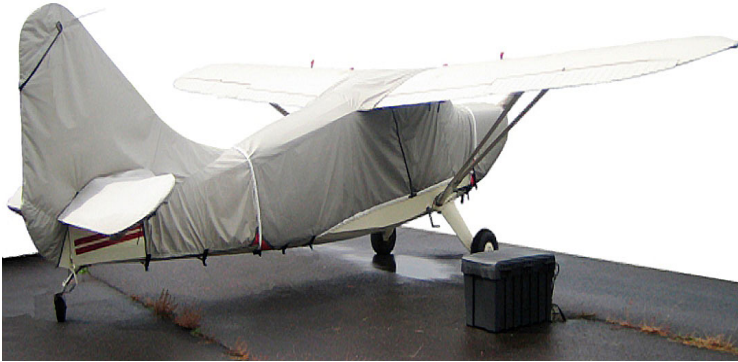
Stinson 108 Canopy, Engine, Prop & Empennage Covers

The material is very reflective, and tests show that the cabin interior temperature can be reduced to near-ambient temperature on the hottest of days. It is water, ice and snow repellent, yet breathable to allow moisture to escape from between the cover and the aircraft surface.