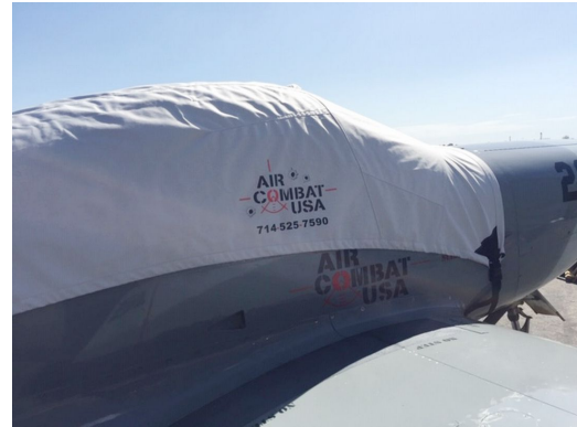
1974 Siai-Marchetti SF 260B Canopy Cover with customized Imprint