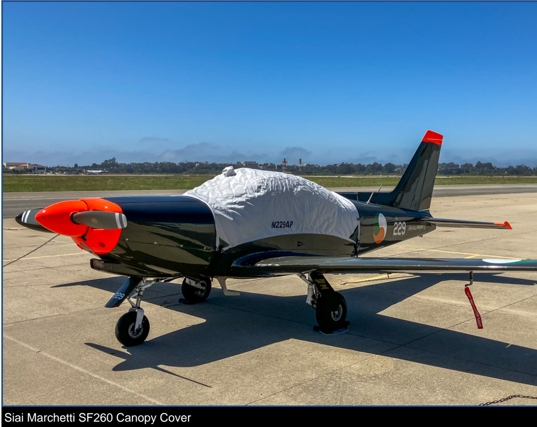
Siai Marchetti SF260 Canopy Cover