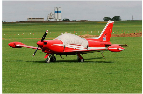
Siai Marchetti SF260 Canopy Cover