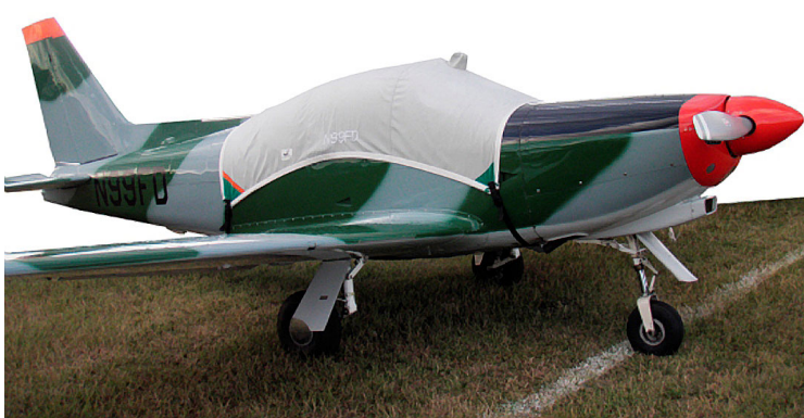
Standard Canopy Cover

This cover type is made from Silver Acrylic Sunbrella canvas and is 100% lined with a soft and smooth microfiber. Bruce's Custom Covers developed this material combination especially for aircraft protection. The outer material is medium weight and treated for water resistance, UV resistance and anti-static buildup. The inner lining is a very soft and smooth microfiber to prevent scratching. The material is very reflective, and tests show that the cabin interior temperature can be reduced to near-ambient temperature on the hottest of days. It is water, ice and snow repellent, yet breathable to allow moisture to escape from between the cover and the aircraft surface.