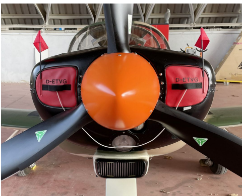
Marcheti SF260C Inlet Plugs

Engine Inlet Plugs are custom fit for your Siai Marchetti SF260 intakes, made with heavy-duty vinyl material, and stuffed with a single block of sculpted urethane foam. Each plug has a zipper that allows the foam to be removed and dried if necessary. Engine plugs have warning flags that are visible from the cockpit or 'remove before flight' streamers sewn onto the face of the plugs. Most plugs are imprinted with the aircraft registration number in black for an extra charge. Storage bag NOT included. Engine plugs may be inserted after flight when the engine is still warm. Engine Inlet Plugs are commonly referred to as Cowl Plugs, Intake Plugs, Cowl Blocks, Engine Blocks, and Engine Bungs.