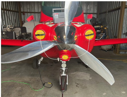
Swearingen SX-300 Engine Plugs

Engine Inlet Plugs are custom fit for your Swearingen SX300 intakes, made with heavy-duty vinyl material, and stuffed with a single block of sculpted urethane foam. Each plug has a zipper that allows the foam to be removed and dried if necessary. Engine plugs have warning flags that are visible from the cockpit or 'remove before flight' streamers sewn onto the face of the plugs. Most plugs are imprinted with the aircraft registration number in black for an extra charge. Storage bag NOT included. Engine plugs may be inserted after flight when the engine is still warm. Engine Inlet Plugs are commonly referred to as Cowl Plugs, Intake Plugs, Cowl Blocks, Engine Blocks, and Engine Bungs.