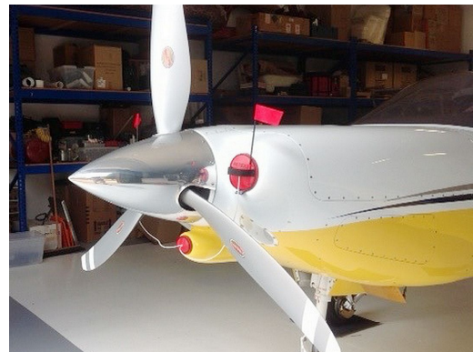
Swearingen SX300 Engine Inlet Plugs