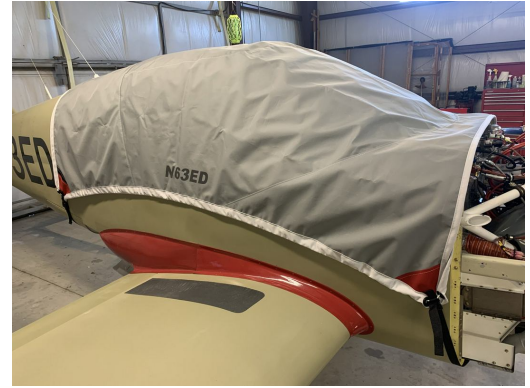
Swearingen SX300 Travel Weight Canopy Cover