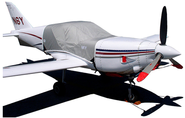
The Swearingen SX300 Canopy Cover, Engine Plugs & Prop Ties