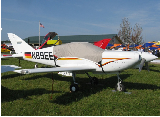
The Swearingen SX300 Canopy Cover

Travel Covers are made with Silver Solution-Dyed Polyester fabric and only lined over the windshield to save weight. The material is lightweight and more compact for easy stowage in the aircraft. The polyester material is water resistant, but only intended for occasional use outside. We also have an ultra lightweight material available for fitted hangar dust covers. For daily outdoor use, the non-travel Sunbrella Cover is the best choice.