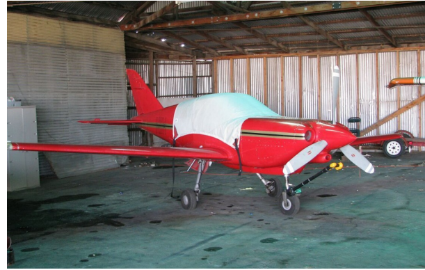
The Swearingen SX300 Canopy Cover