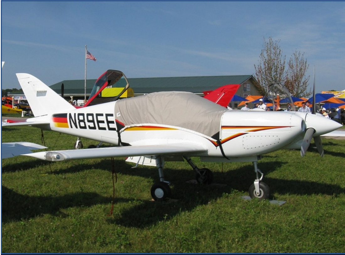
The Swearingen SX300 Canopy Cover