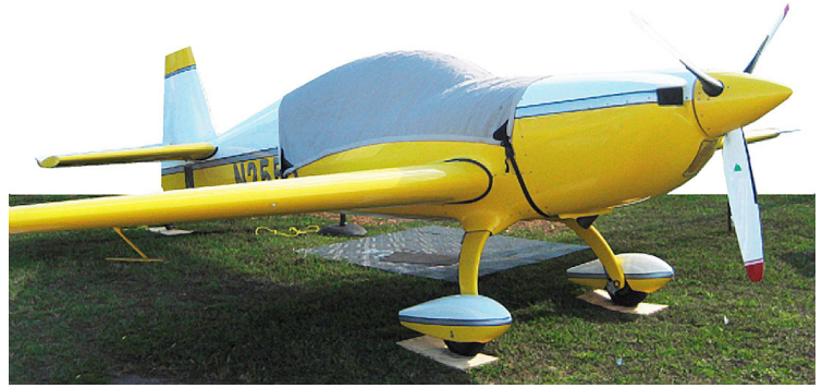
Extra 300/L Canopy Cover