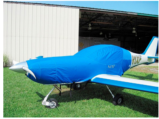
Arion Lightning Extended Canopy/Engine Cover