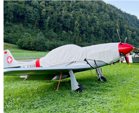
Stewart S-51 Canopy & Engine Covers