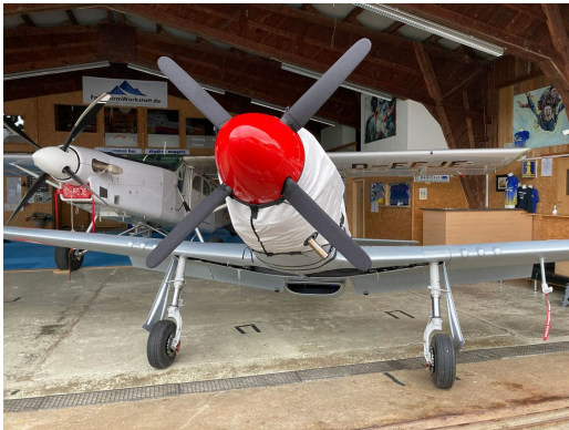
SW-51 Mustang Engine Cover