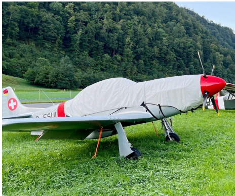
Stewart S-51 Canopy & Engine Covers

Covers developed this material combination especially for aircraft protection. The outer material is medium weight and treated for water resistance, UV resistance and anti-static buildup. The inner lining is a very soft and smooth microfiber to prevent scratching. The material is very reflective, and tests show that the cabin interior temperature can be reduced to near-ambient temperature on the hottest of days. It is water, ice and snow repellent, yet breathable to allow moisture to escape from between the cover and the aircraft surface.