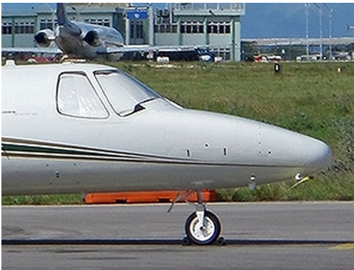
Cessna Citation S550 Cockpit HeatShields