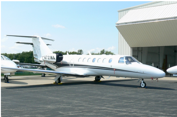
Cessna Citation CJ3 Bikini Style Engine Covers

and dried if necessary. Engine plugs have 'remove before flight' streamers sewn onto the face of the plugs. Most plugs are imprinted with the aircraft registration number in black. Engine plugs may be inserted after flight when the engine is still warm. Engine Inlet Plugs are commonly referred to as Cowl Plugs, Intake Plugs, Cowl Blocks, Engine Blocks, and Engine Bungs.