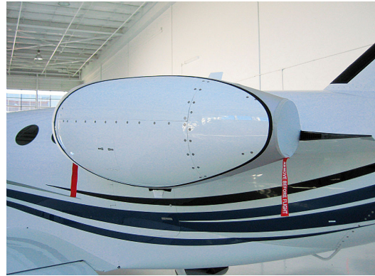
Cessna 510 Mustang Bikini Type Engine Cover