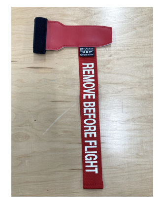
Pitot Tube Cover

Sikorsky S58 Pitot Tube Covers , NOT HEAT RESISTANT TYPE, are made of Naugahyde vinyl, and are designed to cover the entire pitot assembly. Slipping over the tube, the cover tightens around the base with a Velcro strap detail. A "Remove Before Flight" streamer is attached to the cover. Heat Resistant Pitot Covers are an upgrade to this design, and help prevent the pitot cover from melting onto the tube if the pitot heat is accidentally turned on while installed. If you want the set tethered together, please let us know.