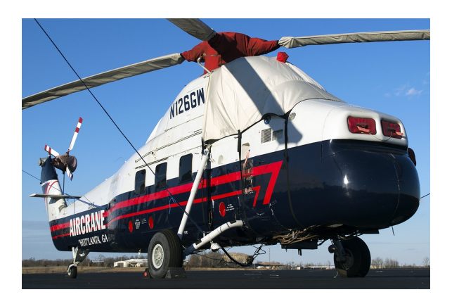
Sikorsky S58T Canopy, Rotor Hub, Blade, Tail Rotor Covers, Engine Plugs, Blade Tie-Downs