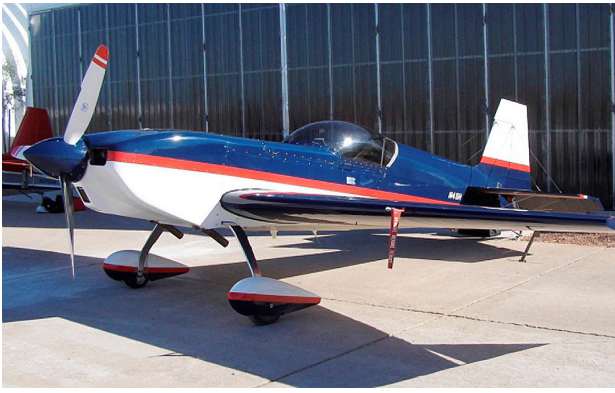
Covers & Plugs for the Staudacher S-600