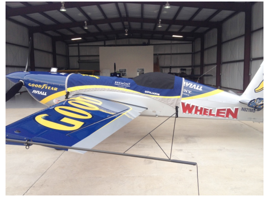
Extra 300SC with NASCAR style custom cover