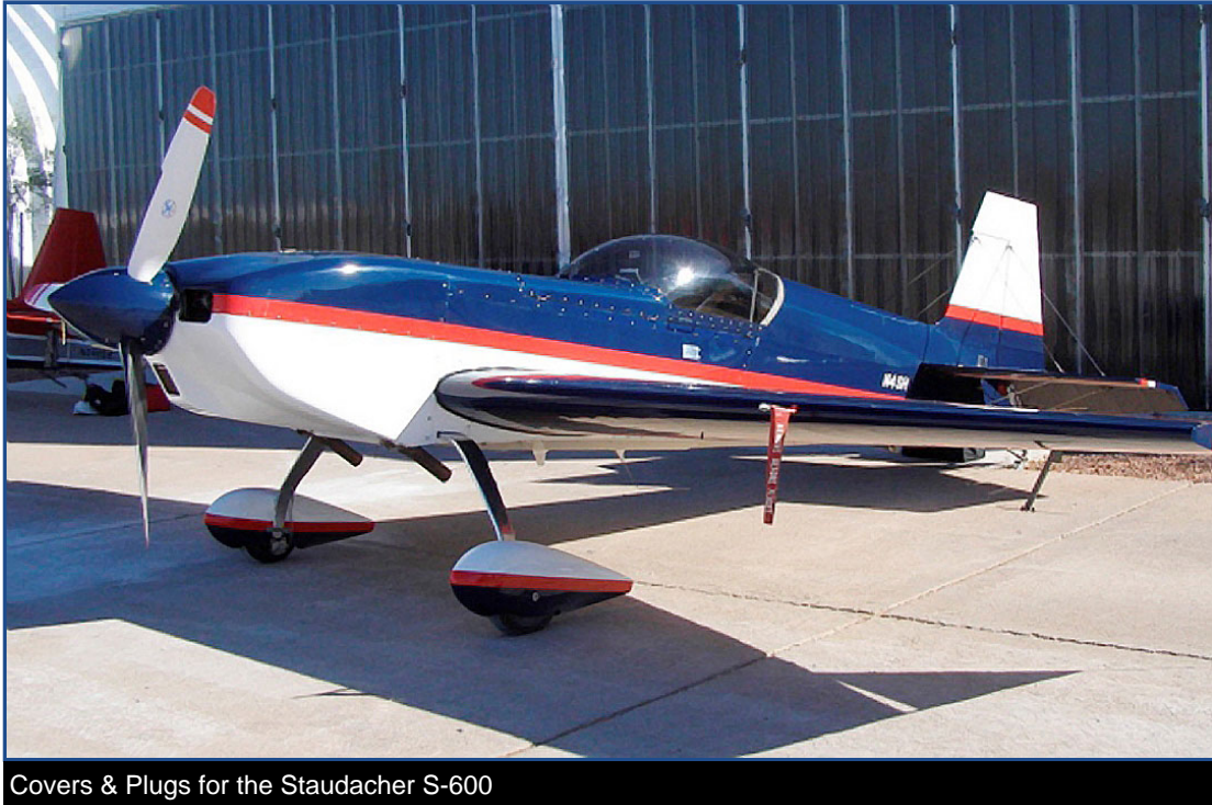
Covers & Plugs for the Staudacher S-600