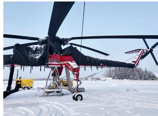
Sikorsky S-64 Skycrane, CH-54 Tarhe Insulated Engine, Rotor Hub, Tailboom, Stabilizer & Tail Rotor Covers