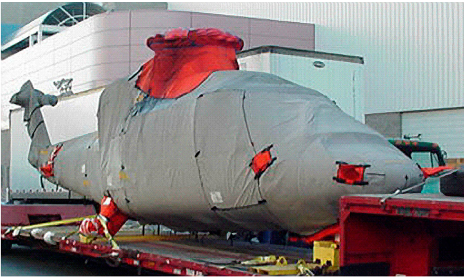
S76 Full Body Transport Cover