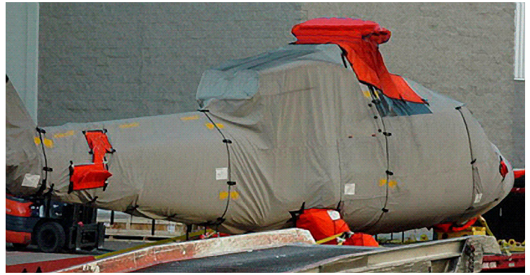
S76 Full Body Transport Cover