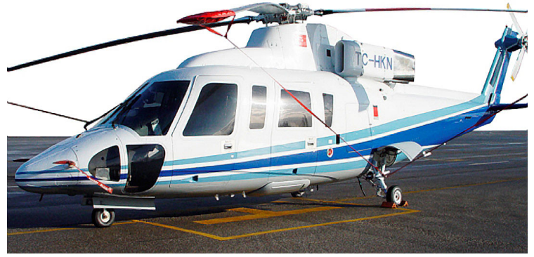
S76 Blade Tie-Downs and Pitot Cover set