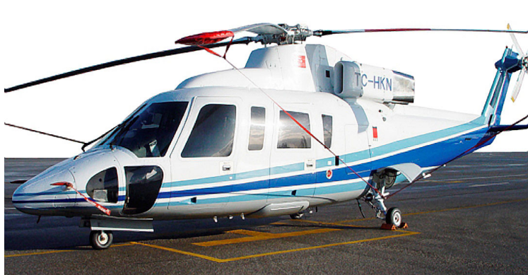
S76 Blade Tie-Downs and Pitot Cover set

WINTER USE MATERIAL - Made with Solution-Dyed Polyester fabric, this option is intended for seasonal use to aid in deicing, rain mitigation, or for occasional travel. The material is lighter and more compact, but more susceptible to UV damage and may have a shorter useful life if used continuously outside than the all-year use material.