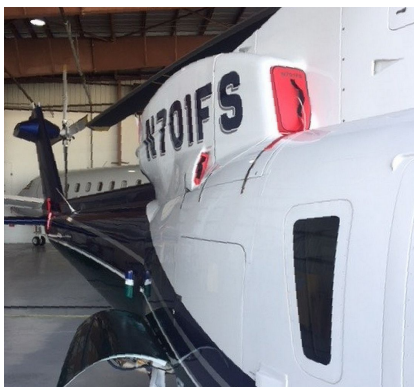
Sikorsky S76 (All Models) Intake Plugs (S76c Models)

The Engine Inlet Plugs are custom fit for your Sikorsky S76 (All Models) intakes, made with heavy-duty vinyl material, and stuffed with a single block of sculpted urethane foam. Each plug has a zipper that allows the foam to be removed and dried if necessary. Engine plugs have 'Remove Before Flight' streamers sewn onto the face of the plugs. Most plugs are imprinted with the aircraft registration number in black for an extra charge. Storage bag NOT included. Engine plugs may be inserted after flight when the engine is still warm. Engine Inlet Plugs are commonly referred to as Cowl Plugs, Intake Plugs, Cowl Blocks, Engine Blocks, and Engine Bungs.