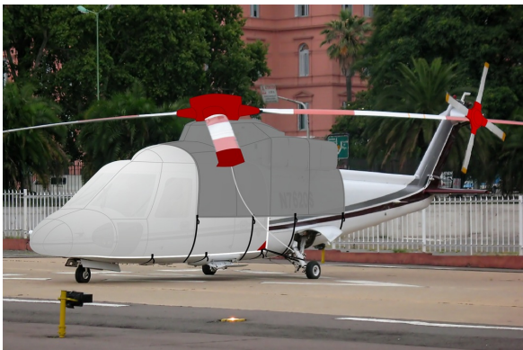
S76 Forward Fuselage, Engine, Main & Tail Rotor Hub Covers (illustration)