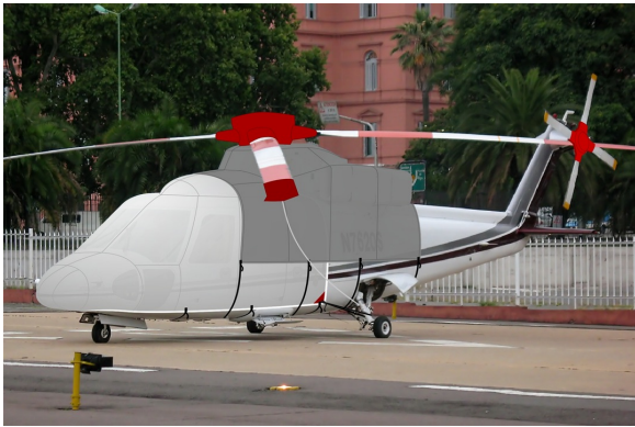
S76 Forward Fuselage, Engine, Main & Tail Rotor Hub Covers (illustration)

WINTER USE MATERIAL - Made with Solution-Dyed Polyester fabric, this option is intended for seasonal use to aid in deicing, rain mitigation, or for occasional travel. The material is lighter and more compact, but more susceptible to UV damage and may have a shorter useful life if used continuously outside than the all-year use material.