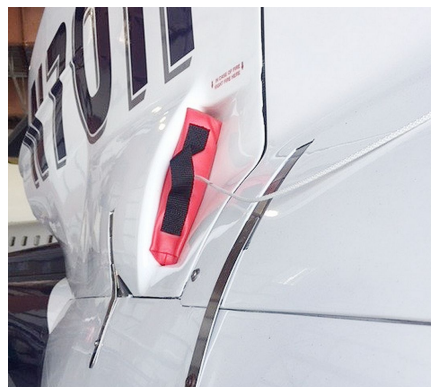
Sikorsky S76 (All Models) Intake Plugs (S76c Models)