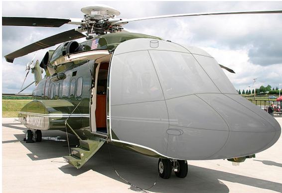
Sikorsky S-92 Windshield/Nose Cover (illustration)

This cover type is made from Silver Acrylic Sunbrella canvas and is 100% lined with a soft and smooth microfiber. Bruce's Custom Covers developed this material combination especially for aircraft protection. The outer material is medium weight and treated for water resistance, UV resistance and anti-static buildup. The inner lining is a very soft and smooth microfiber to prevent scratching. The material is very reflective, and tests show that the cabin interior temperature can be reduced to near-ambient temperature on the hottest of days. It is water, ice and snow repellent, yet breathable to allow moisture to escape from between the cover and the aircraft surface.