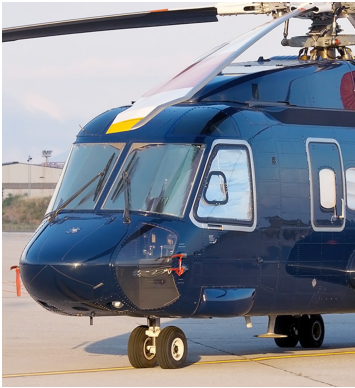
Sikorsky S-92 Cockpit HeatShields

material so that it conforms to the complex shape of the helicopter windows. The set folds up flat and is easily stored in the included storage sleeve. Some designs may require velcro and suction cups. A Heatshield is an excellent short-term remedy for cockpit overheating, but an external fabric cover is more effective for long-term protection.