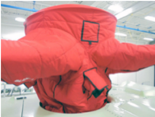
Sikorsky S-92 Main Rotor Mast Cover, Insulated, w/Heater Hose Inlets