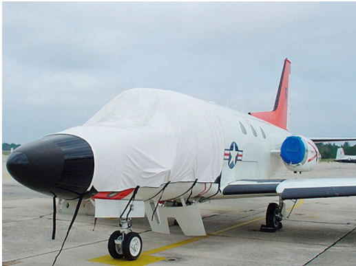
Sabre 40 Cockpit and Engine Covers set