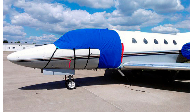
Rockwell Sabre Cockpit/Door Cover