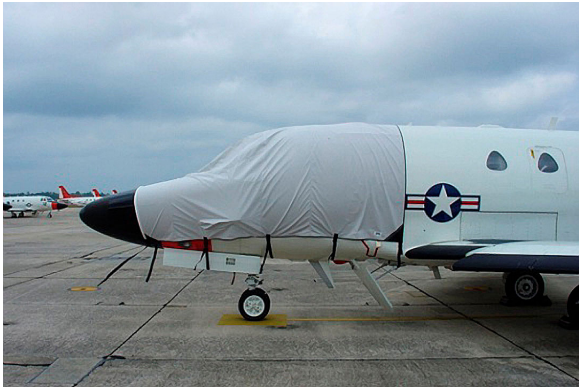
Sabre 40 Cockpit Cover

This cover type is made from Silver Acrylic Sunbrella canvas and is 100% lined with a soft and smooth microfiber. Bruce's Custom Covers developed this material combination especially for aircraft protection. The outer material is medium weight and treated for water resistance, UV resistance and anti-static buildup. The inner lining is a very soft and smooth microfiber to prevent scratching. The material is very reflective, and tests show that the cabin interior temperature can be reduced to near-ambient temperature on the hottest of days. It is water, ice and snow repellent, yet breathable to allow moisture to escape from between the cover and the aircraft surface.