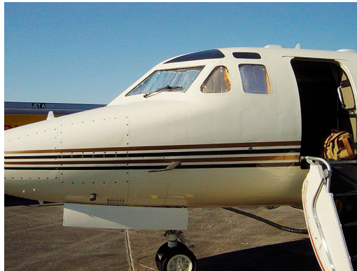
Sabre Cockpit HeatShields Set

Heatshields are interior sunshades for an aircraft's windows or canopy glass. The product is a unique composite of closed-cell foam with a silver mylar finish. The semi-rigid design is stiff enough to stand along the inside of the windshield using sun visors or window framing. It folds up flat and easily stores in the included storage sleeve. Some designs may require velcro and suction cups. A Heatshield is an excellent short-term remedy for cockpit overheating.