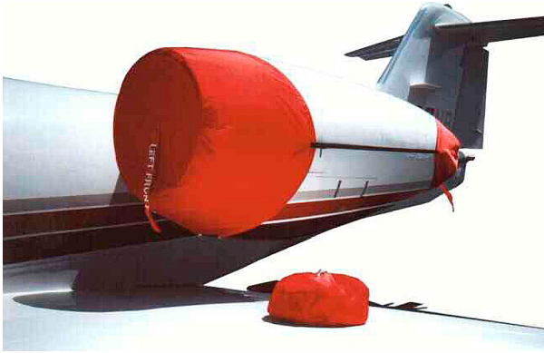
Lear 30 Tri-Fold Engine Cover

The Rockwell Sabre 40, 65, 75, 80 Bikini Style Engine Covers are a single-piece design using a soft and smooth stretchy fabric. The cover stretches tightly over both the intake and exhaust, installing quickly and easily. These covers are designed to be used as hangar dust covers and have a useful life of approximately one year.