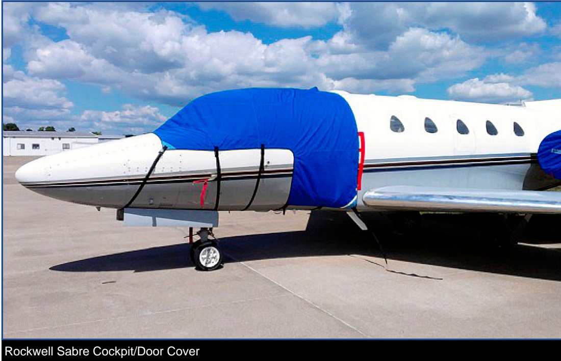
Rockwell Sabre Cockpit/Door Cover