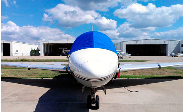
Rockwell Sabre Cockpit/Door Cover

This cover type is made from Silver Acrylic Sunbrella canvas and is 100% lined with a soft and smooth microfiber. Bruce's Custom Covers developed this material combination especially for aircraft protection. The outer material is medium weight and treated for water resistance, UV resistance and anti-static buildup. The inner lining is a very soft and smooth microfiber to prevent scratching. The material is very reflective, and tests show that the cabin interior temperature can be reduced to near-ambient temperature on the hottest of days. It is water, ice and snow repellent, yet breathable to allow moisture to escape from between the cover and the aircraft surface.