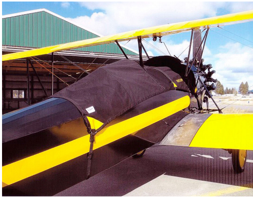
Stearman C3 Canopy Cover