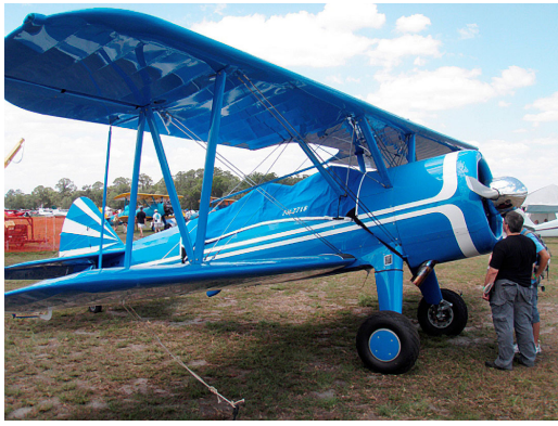
Stearman Canopy Cover (std. color is silver)