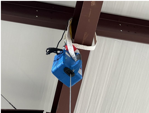
Stearman PT-13 Full Body Dust Cover, Remote Control Winch

Some high value aircraft end up logging lots of hangar time, and become dust magnets in the process. A high quality, well fitting dust cover provides easy assurance that the aircraft's surfaces remain clean and free of grit and grime. Available in a large variety of colors, each dust cover is custom made according to aircraft details and customer preferences. Fire retardant fabrics are also available.