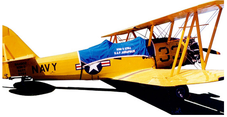
N3N Canopy Cover