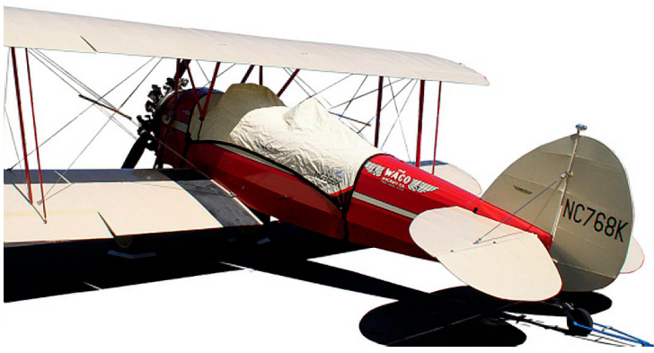
Waco 10 Canopy Cover