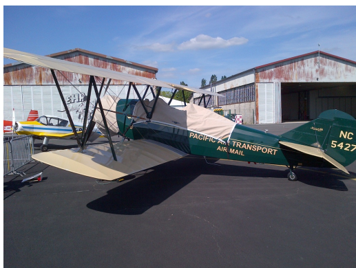
Travelair 4000 Canopy and Engine Cover