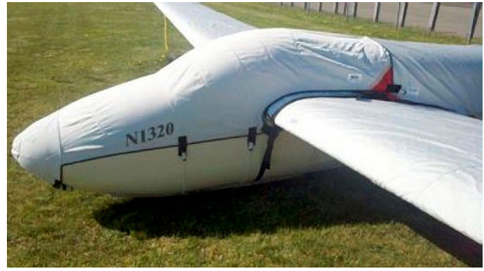
Schweizer SGS 1-26B Canopy/Nose, Wings & Empennage Covers