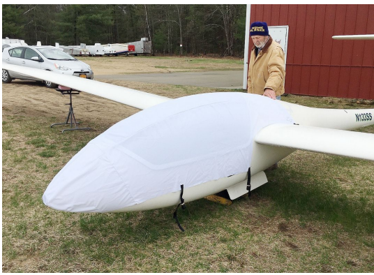
Grob 102 Astir CS Canopy/Nose Cover (test fit)