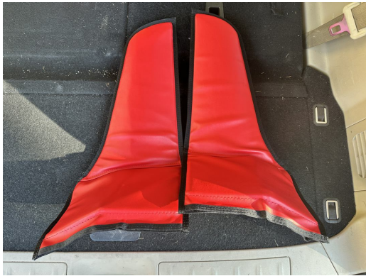
Discus CS Wingtip Pads (Set of 2)

Designed to prevent damage to the aircraft extremities in crowded hangars, these products are made of bright red Naugahyde and thickly padded with a sandwich of closed cell foam. Nowadays they are also made using bright read Neoprene padded laminated (think: wetsuit material).