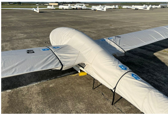
Schempp-Hirth Discus 2B Complete Cover Set