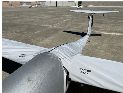
Schempp-Hirth Standard Cirrus Wing & Empennage Covers