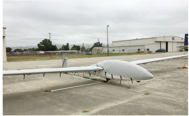
Canopy/Nose Cover, Wings and Horizontal Stab Covers