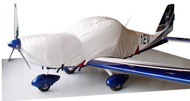
Ekvator Sportstar Extended Canopy/Engine Cover

This cover type is made from Silver Acrylic Sunbrella canvas and is 100% lined with a soft and smooth microfiber. Bruce's Custom Covers developed this material combination especially for aircraft protection. The outer material is medium weight and treated for water resistance, UV resistance and anti-static buildup. The inner lining is a very soft and smooth microfiber to prevent scratching. The material is very reflective, and tests show that the cabin interior temperature can be reduced to near-ambient temperature on the hottest of days. It is water, ice and snow repellent, yet breathable to allow moisture to escape from between the cover and the aircraft surface.