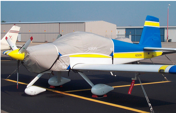
Van's RV-9 Canopy & Engine Covers