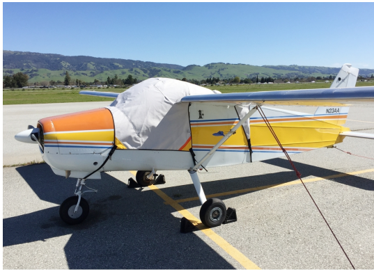
Bolkow Junior 208 Canopy Cover